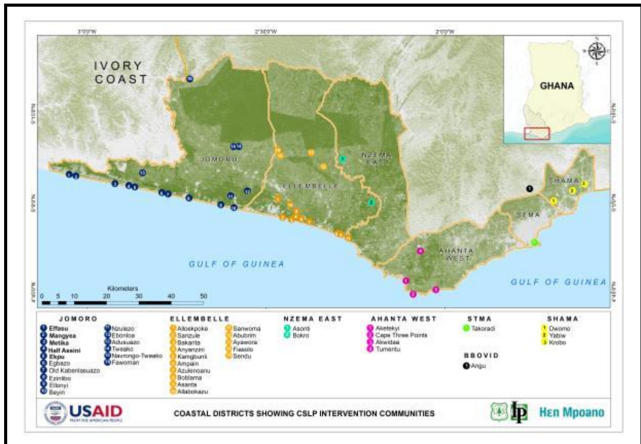
Figure 1. The six coastal districts of the CSLP area and core intervention communities

Road infrastructure in the region is poor, and communication technology weak, and together present daily challenges for accomplishing project goals. The technical team has embraced the lessons learned from the initial years of the project and it will continue to learn and apply these in FY2018, the fifth year of the project.