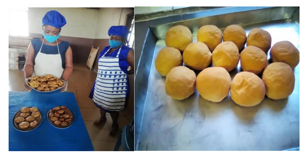
Figure 6 Final products (cookies and bread rolls) made on the Ahotor oven and ready for sale

Other in-kind grants: In addition to the 138 participants who took place in SFMP-sponsored livelihoods trainings, the project provided in-kind grant support to 16 individuals who had completed trade apprenticeships but could not access the finance to procure the tools and equipment required to launch their businesses. The partners selected the 16 beneficiaries with a similar criteria as noted with the three livelihood options except those who have already acquired a skill. The IPs supported with the identification of the in – kind grants package. SFMP provided these recipients with in-kind grants of up to GHS 15,559 in total and GHS 972 average per person. A breakdown of livelihoods supported through stand-alone in-kind grants is shown in Table 3.