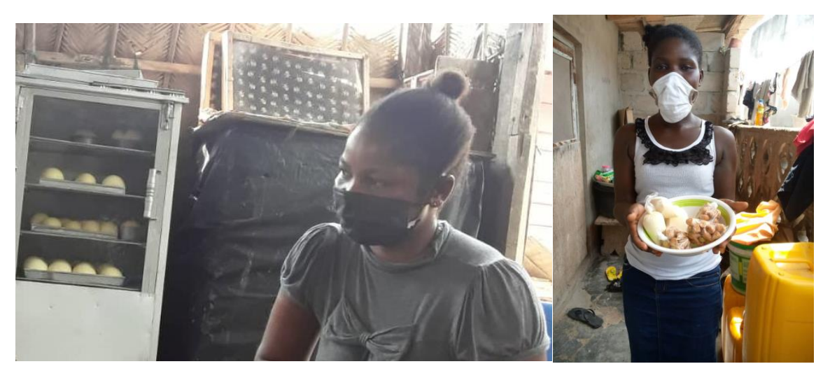
Figure 9 Baking products getting ready for the market

responded that they had been able to buy additional equipment to supplement the starter packs given to them by SFMP. In terms of support, five beneficiaries (21%) stated they needed financial capital to expand their business. The rest indicated that because they were just starting up, they did not have any immediate needs.