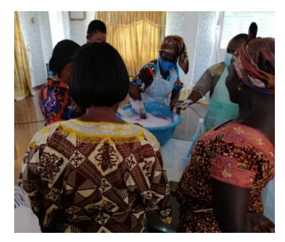
Figure 1 Training on the production of handwashing soap

handwashing stations to fish landing and processing sites in all four coastal regions. As people in fishing communities and everywhere in Ghana adhered to the handwashing protocol, the demand for handwashing soap increased, creating an opportunity for more soap producers. A total of 96 youth, mainly fish processors and traders, received training on the production of handwashing soap to supplement their income. SFMP provided startup kits including chemicals and fragrances to enable them to produce their first line of handwashing soap following the training. SFMP partners CEWEFIA and DAA procured handwashing soap from the trainees to supply the 103 handwashing stations at fish landing sites in their intervention zones. To date, these two partners have procured 1,845 liters of handwashing soap from 46 women valued at GHS 10,900 (approximately US$ 1,896), and participants continue to sell to customers in their local markets as well.