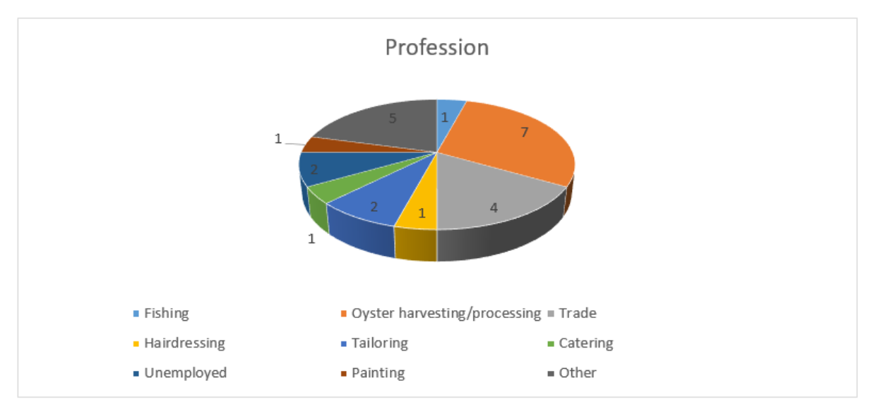
Figure 7 Professions of participants before training

while seven others (29%) stated they would have searched for other means as a source of livelihood.