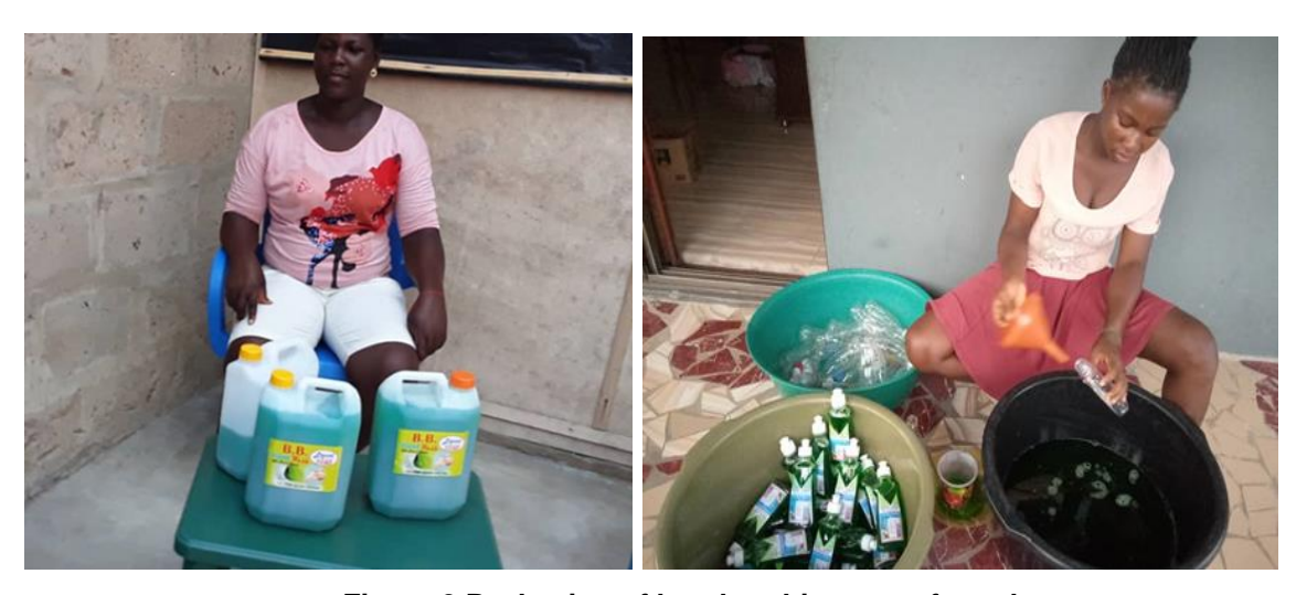
Figure 2 Packaging of handwashing soap for sale

Training on baking and confection: Twenty women participating in trainings on baking and confectionary of popular local foods such as meat pasties, chin chin , bread and spring rolls ( Figure 3 ). They were also trained on customer care and marketing skills. On completion of the trainings, participants each received in-kind support packages containing tools and equipment worth GHS 1,275 (US$ 222) to enable them start operating immediately. The products from the trainings and left over ingredients were handed over to them to start their businesses.