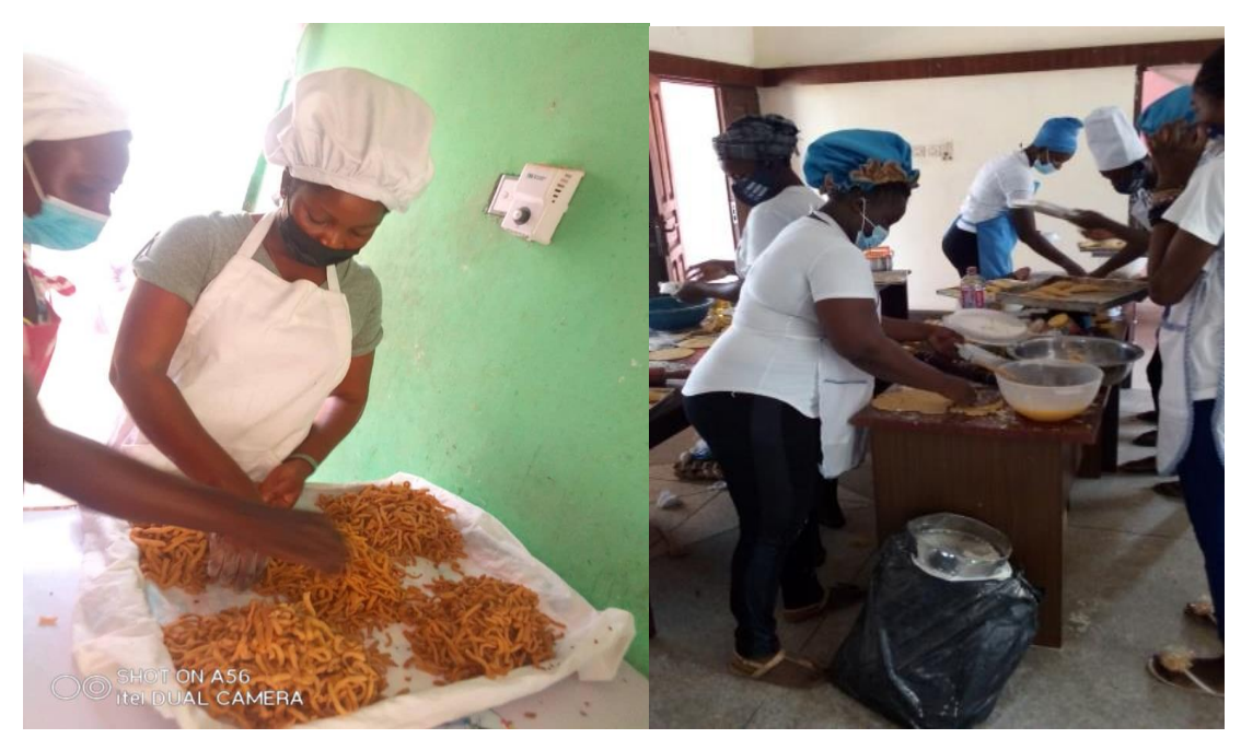
Figure 3 Training on bakery and confectionery