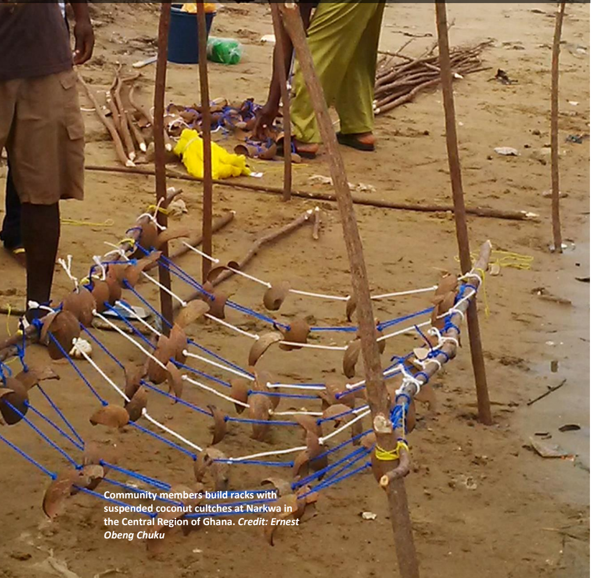
Community members build racks with suspended coconut cultches at Narkwa in the Central Region of Ghana.