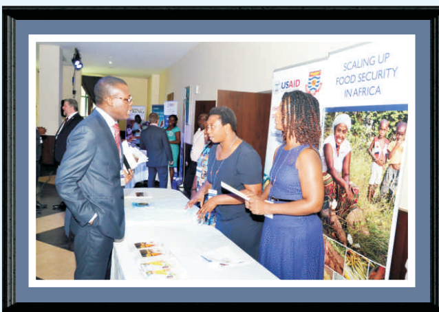
Minister of Agriculture Hon. Fifi Kwetey at the Africa Lead stand