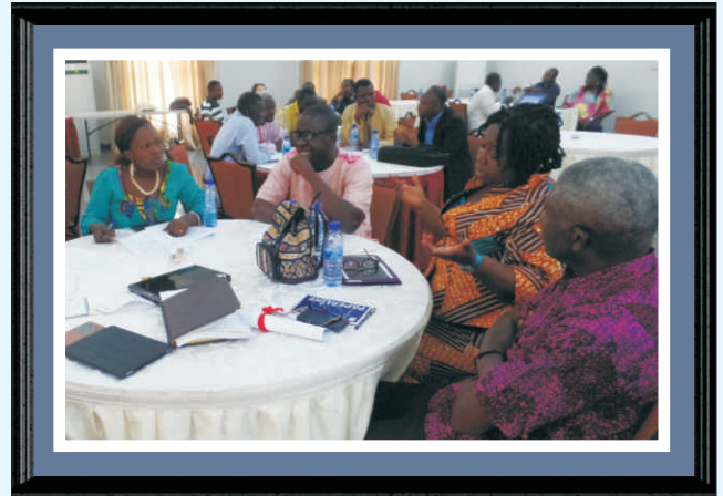
A cross section of participants at the plenary session.