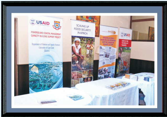
2015 USAID Ghana Implementing Partners Meeting