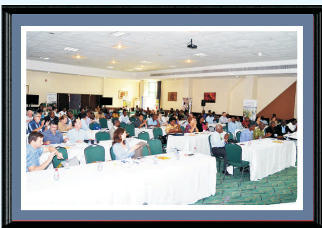
Plenary session at the IP meeting