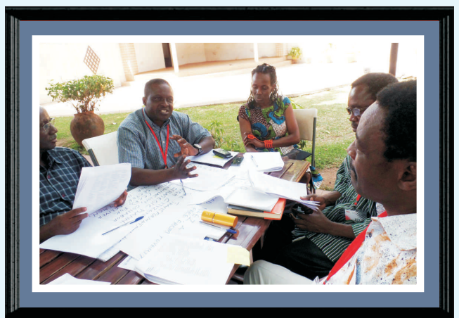
Group discussions: SADA staff