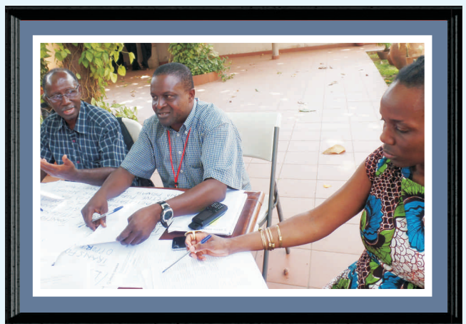
Group discussions: SADA staff