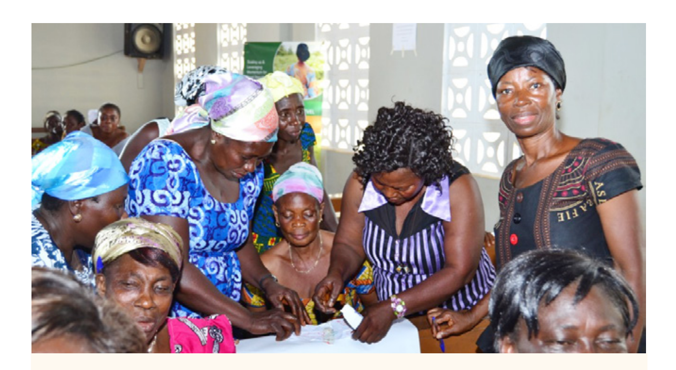
Africa Lead Celebrates 2016 International Rural Women's Day

The International Rural Women's day is annually celebrated to honor and recognize the role of women in agriculture, rural development, poverty eradication and nation building.