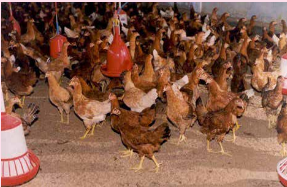
Improved poultry feed is helping to boost poultry production in Ghana