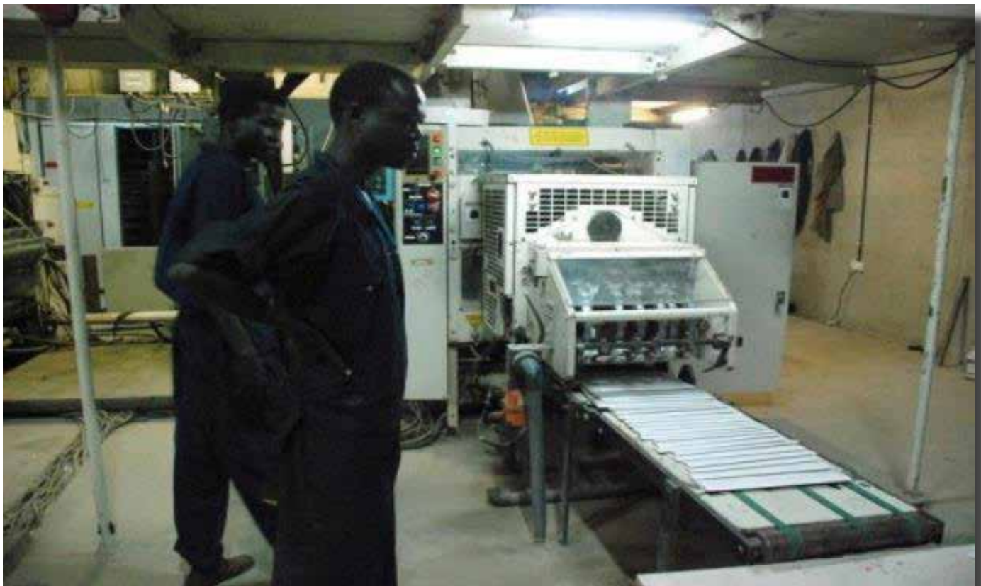
Staff at work at a local book printing firm

"When these taxes are waived, the cost of printing books locally will be drastically reduced, and the price of locally printed books will become comparable to the price of imported books. Many publishers who were previously reluctant to engage local printers because of the high cost will now begin to print locally, thus creating more jobs and income for the local printing industry", Mr.