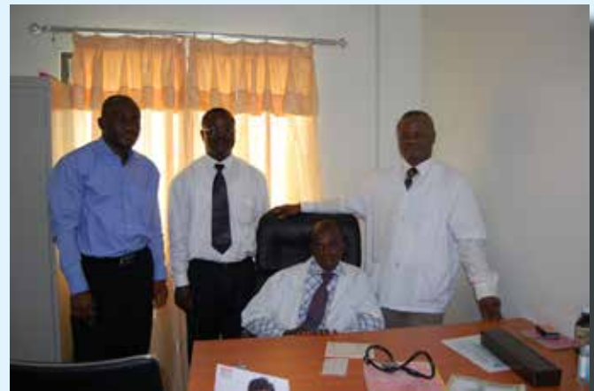
Medical Herbalists at post at the Kumasi South Hospital

“A significant portion of our services are now covered under the NHIS. Currently, consultation and laboratory