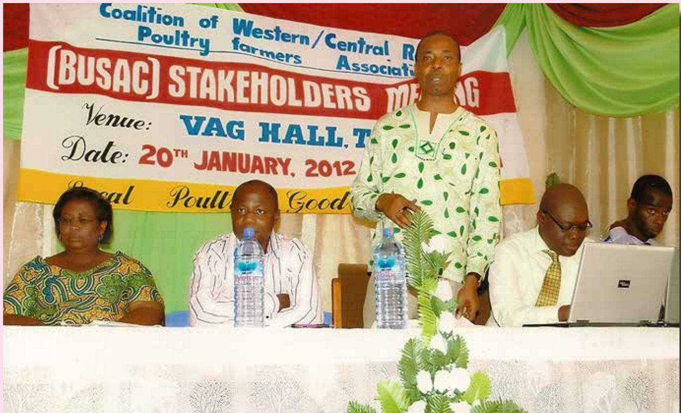
Members of Poultry Farmers Association of Ghana at a stakeholders' workshop

Poultry farmers in the Central and Western regions of Ghana are expanding their farms through the use of standardized and improved fishmeal.