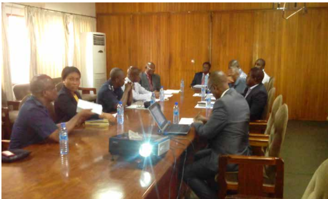
The leadership of GPPCA in dialogue with officials of Ministry of Finance and Ghana Revenue Authority