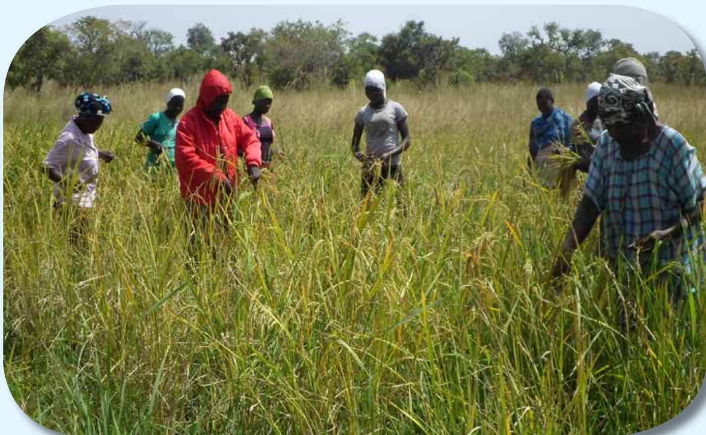
Members of PUWOFACS harvesting rice in their farm

Members of PUWOFACS are also testifying that