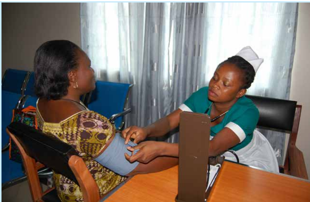
A nurse attending to a patient at the herbal medicine unit of the Kumasi South Hospital

increased volume of work makes it possible to offer practical training opportunities for trainee medical herbalists on internship at the various public hospitals”, he further explained.