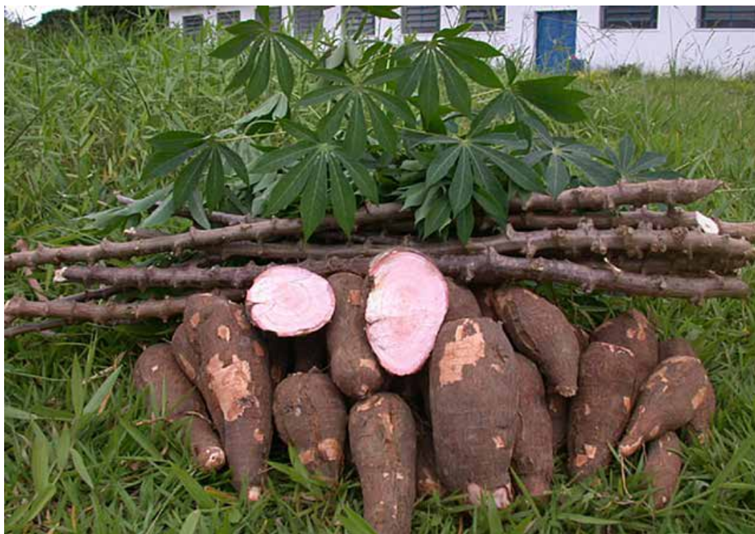
Freshly harvested healthy cassava tubers

Story: Ebenezer Kpentey, the BUSAC Fund.