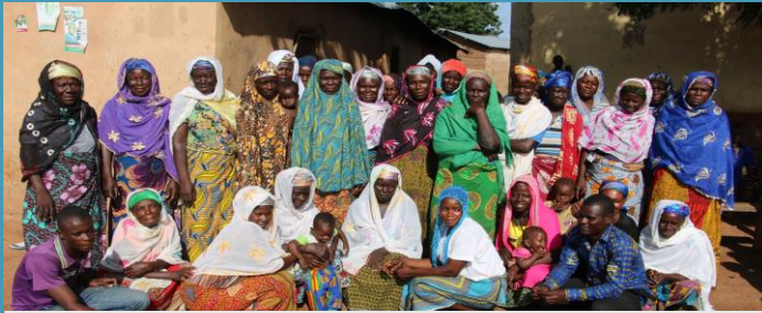
Some members of the two VSLAs in Kulunkpegu in the Gushegu District, Northern Region