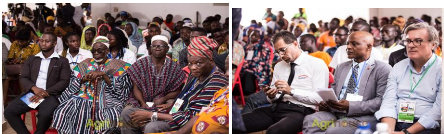
Cross-section of participants during the opening ceremony of the pre-harvest event in Tamale