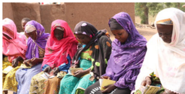
Members of SIRDA VSLA (Africa Lead Grantees)

The women agripreneurs manage their groups knowing from personal experience how each cedi saved with loan provided can reap larger dividends for them, their businesses and communities.