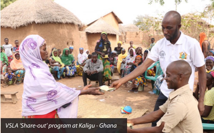
VSLA 'Share-out' program at Kaligu - Ghana

Led by an active member of the C4C Women in Agribusiness Network Ghana (WIANG), SIRDA successfully implemented its Village Saving Loans Associations (VSLA) micro-finance savings model in four districts in the Northern region of Ghana. The program established VSLAs in 88 different communities, far exceeding the original target of reaching women in 40 communities. In total, SIRDA trained 2,611 women living in these communities on integrated farm management and value-chain development (IFMVD).