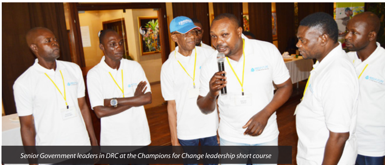
Senior Government leaders in DRC at the Champions for Change leadership short course

Parliamentarians and high level Government officials participate in Champions for Change Leadership Short course