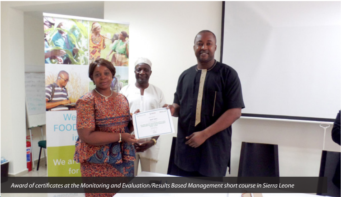
Award of certificates at the Monitoring and Evaluation/Results Based Management short course in Sierra Leone

A s part of efforts to build the capacity of Ministry of Agriculture, Forestry and Food Security (MAFFS), Africa Lead delivered a five-day short course on Monitoring and Evaluation (M&E) and Results Based Management (RBM).