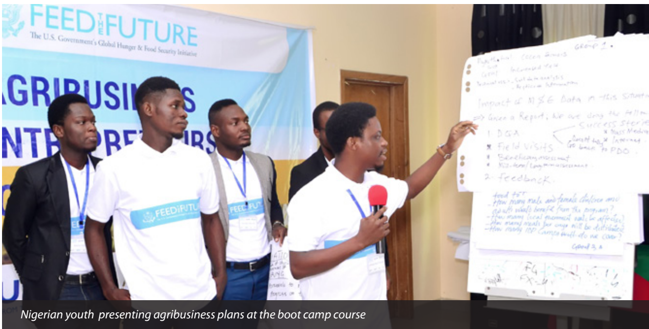
Nigerian youth presenting agribusiness plans at the boot camp course

was setting myself up for failure. Thanks to the training, I am now selling my fruits and vegetables through an e-commerce platform and I can barely keep up with the increase demand for my produce." Africa Lead also organized two boot camps for youth enterprises in the Northern and Southern regions of Ghana.