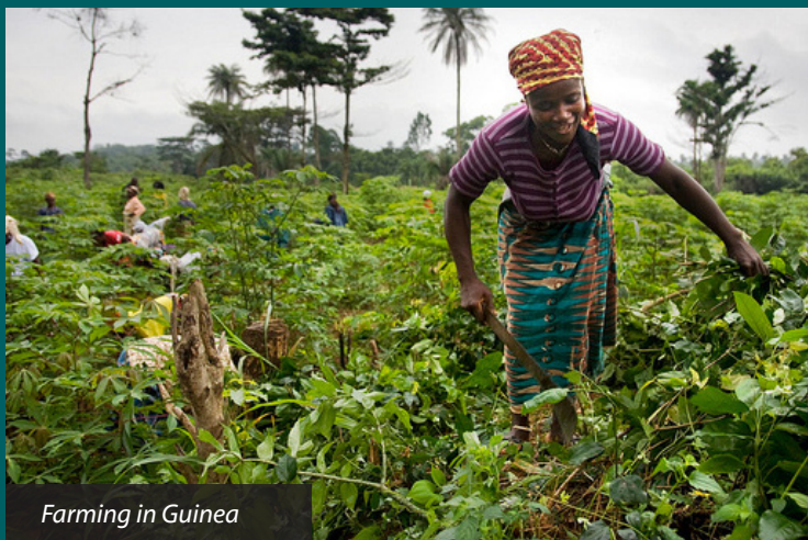
Farming in Guinea

As part of the Plan National d'Investissement Agricole, de Sécurité Alimentaire et de Nutrition (PNIASAN) review process in Guinea, Africa Lead organized a retreat devoted to the development of an action plan for the PNIASAN.