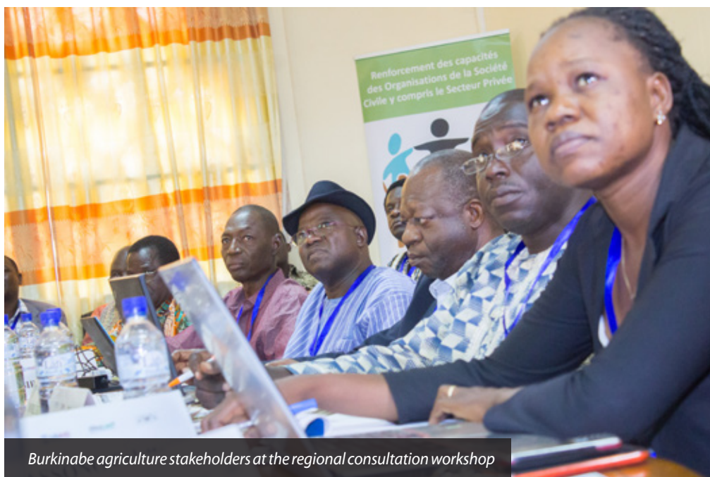
Burkinabe agriculture stakeholders at the regional consultation workshop

that the priorities and specific needs of those living in these regions is incorporated into the PNSR II.