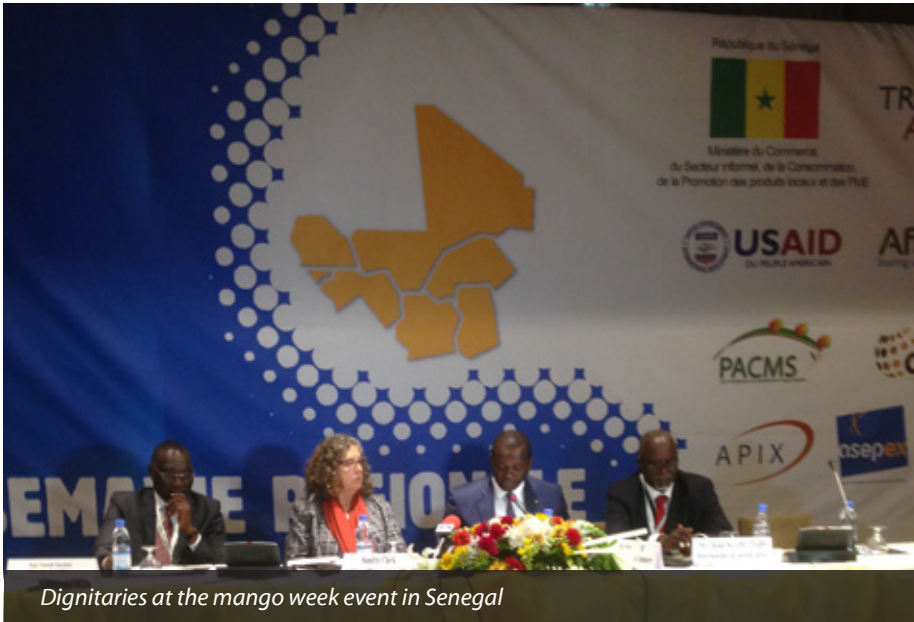
Dignitaries at the mango week event in Senegal

Ninety-two participants attended the event. At the end of the workshop, actors agreed on a roadmap that would allow them to effectively create and run a professional Senegal mango association.