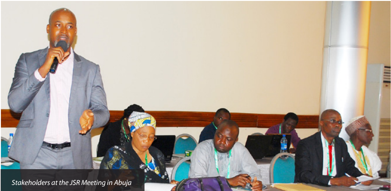
Stakeholders at the JSR Meeting in Abuja

Africa Lead collaborated with the Alliance for Green Revolution in Africa (AGRA), German Corporation for International Cooperation (GIZ), Regional Strategic Analysis and Knowledge Support Systems (RESAKSS) and Federal Ministry of Agriculture and Rural Development (FMARD) to conduct the first Joint Sector Review (JSR) in Nigeria. The JSR steering committee, chaired by the Honorable Minister of Agriculture and a Vice-Chairman from the Non-State Actors group convened the JSR.