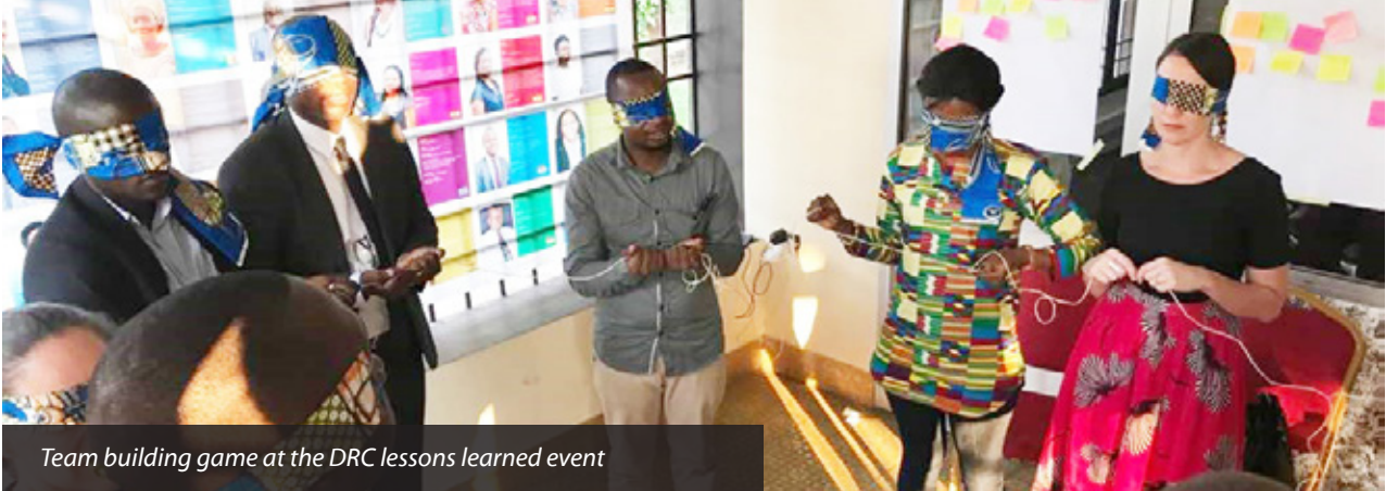
Team building game at the DRC lessons learned event