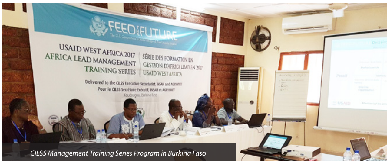
CILSS Management Training Series Program in Burkina Faso

A frica Lead collaborated with CILSS to develop and finalize the 2017 Executive Management Training Series to develop capacity in critical organizational areas. The course topics identified were Results-Based Management, Program Design, Project Management, Monitoring and Evaluation, People Management and Supervisory Skills.