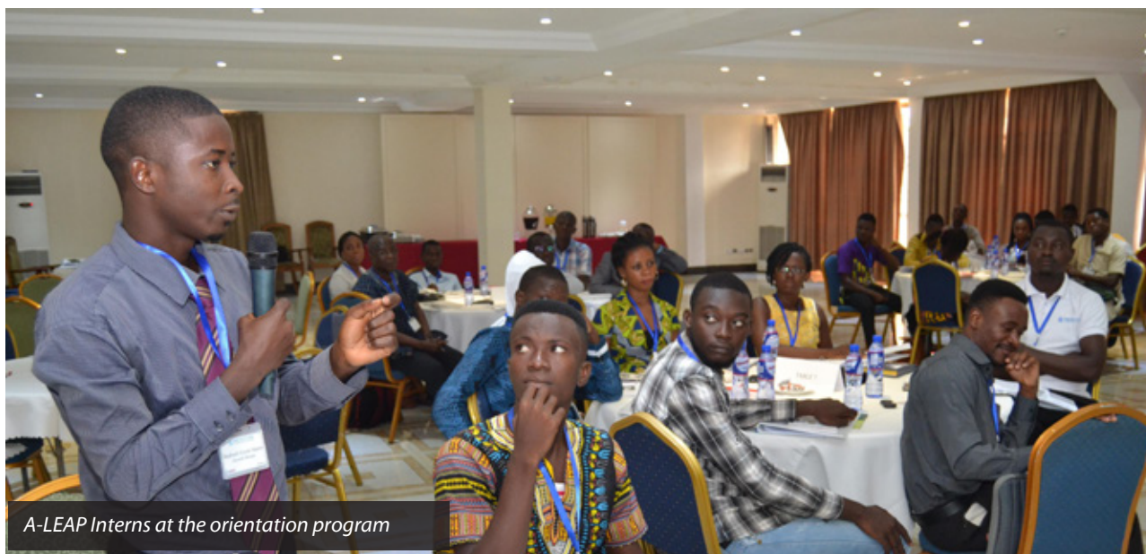
A-LEAP Interns at the orientation program

A frica Lead re-launched the Agribusiness Internship Program (A-LEAP Internships) as part of its youth workforce development strategy to shape and prepare Africa's next generation of entrepreneurs, thinkers and innovators in agribusiness.