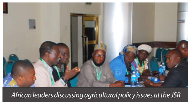
African leaders discussing agricultural policy issues at the JSR

Development partners, regional and civil society organizations such as the Economic Community of West African States (ECOWAS), United States Agency for International Development (USAID), and Action Aid participated in the event.