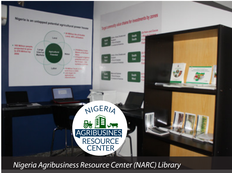
Nigeria Agribusiness Resource Center (NARC) Library

The Federal Ministry for Agriculture and Rural Development (FMARD) launched, with technical assistance and support from Africa Lead, the Nigeria Agribusiness Resource Center (NARC) on October 26, 2017 in Abuja.