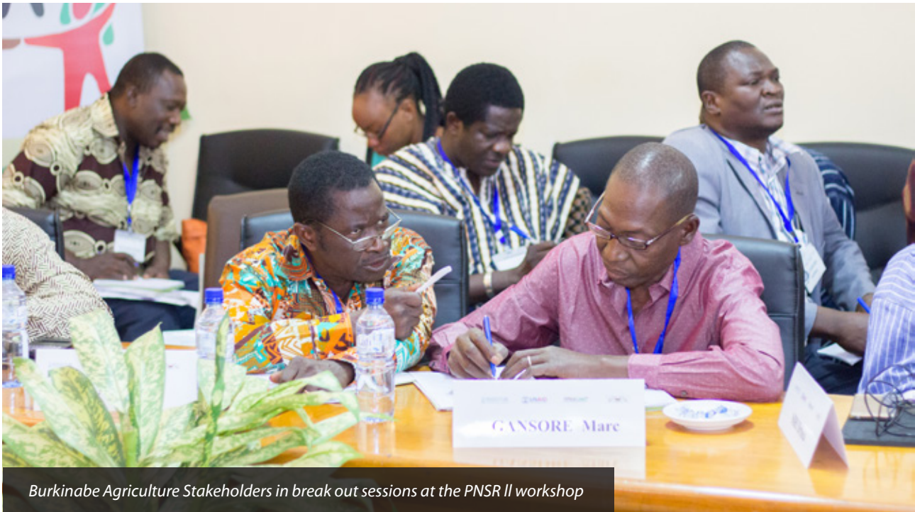
Burkinabe Agriculture Stakeholders in break out sessions at the PNSR II workshop

Effective agricultural policy development requires commitment to broadly shared goals and an inclusive process in which all stakeholders participate in policy dialogues.