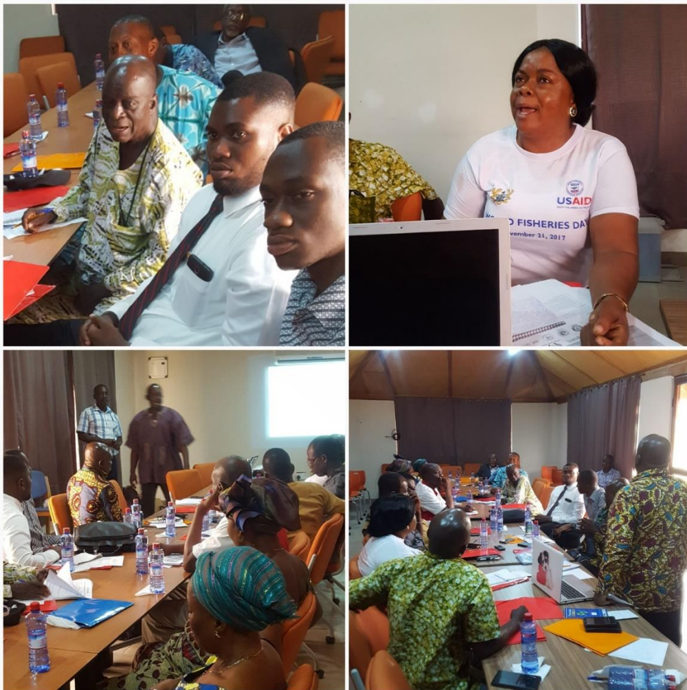
Figure 4. A picture of cross section of participants discussing the NFMP at one of the meetings.