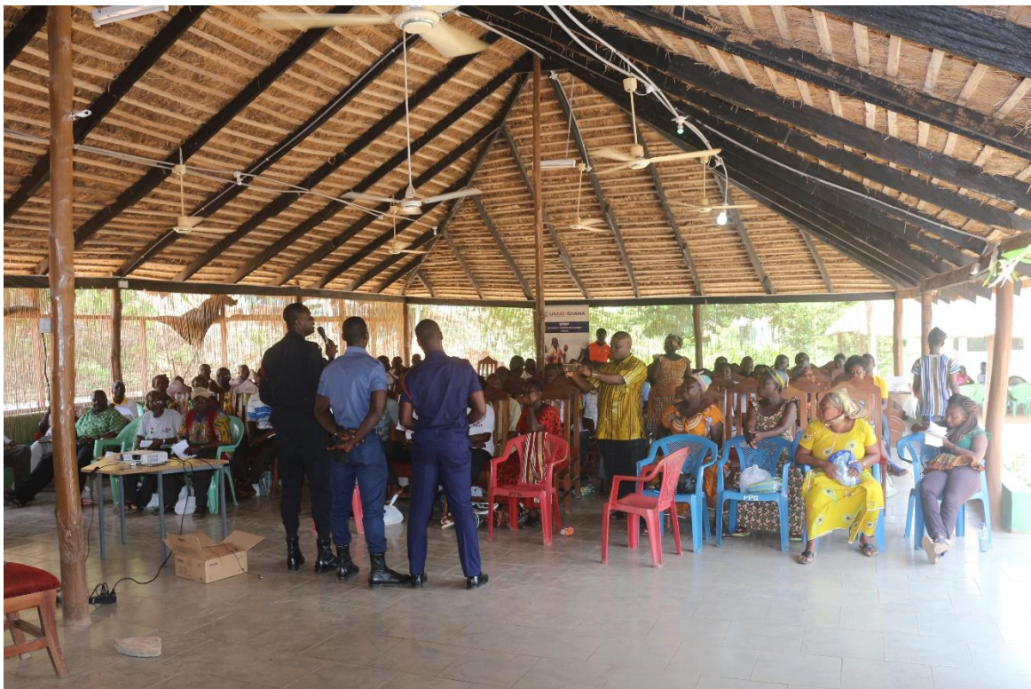
Figure 6. A picture with Representatives of FEU making presenting their observation of closed season implementation at the Western Region Meeting.

The FEU entreated the local fishers to support the FEU monitor trawlers activities during the closed season by reporting any suspected trawling by any vessel.