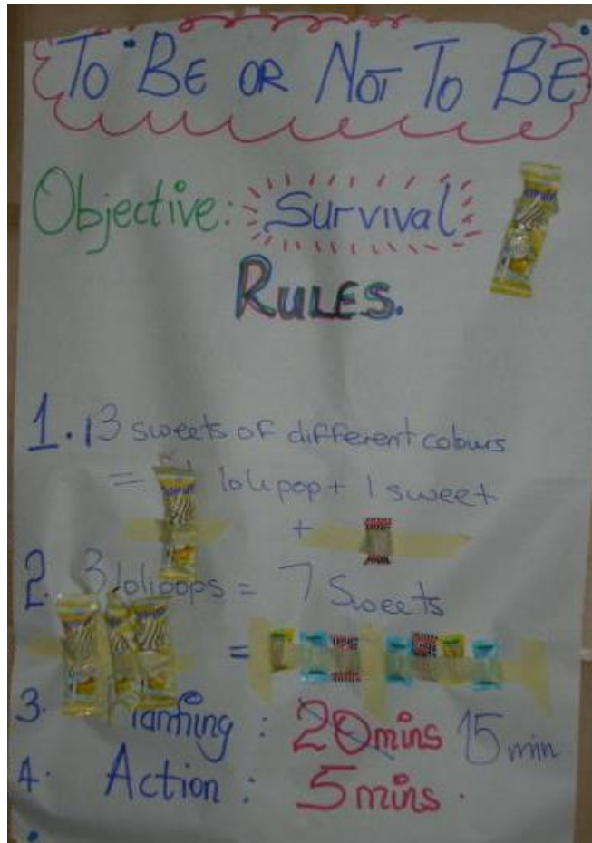
Figure 6: Instruction chart to "To be or Not To Be"