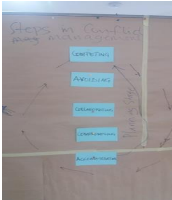
Figure 5: Result of conflict management discussions.