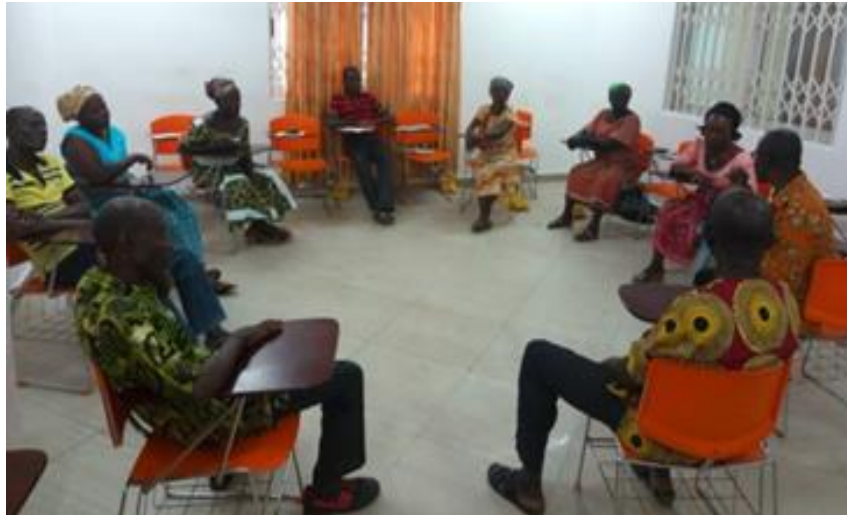
Figure 1: Participants during the Yarn coil exercise