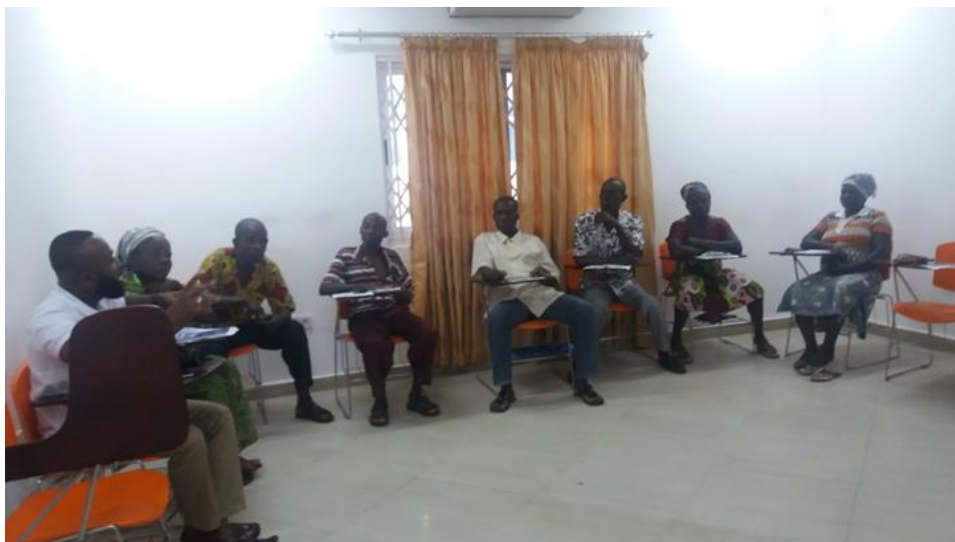
Figure 3: Participants processing the tower building exercise