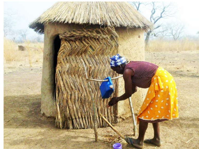
A community member from Bisaldo, Saboba District washes her hands with soap and water using a tippy tap.