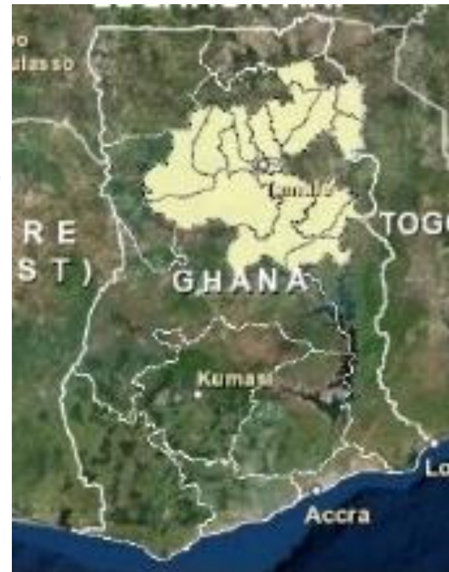
Figure 1: Map of 17 Implementation Districts in Northern Region, Ghana