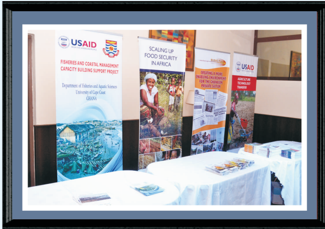
2015 USAID Ghana Implementing Partners Meeting