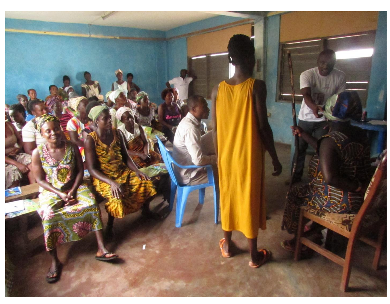
Figure 5 A drama being performed to give a clear understanding of the topic