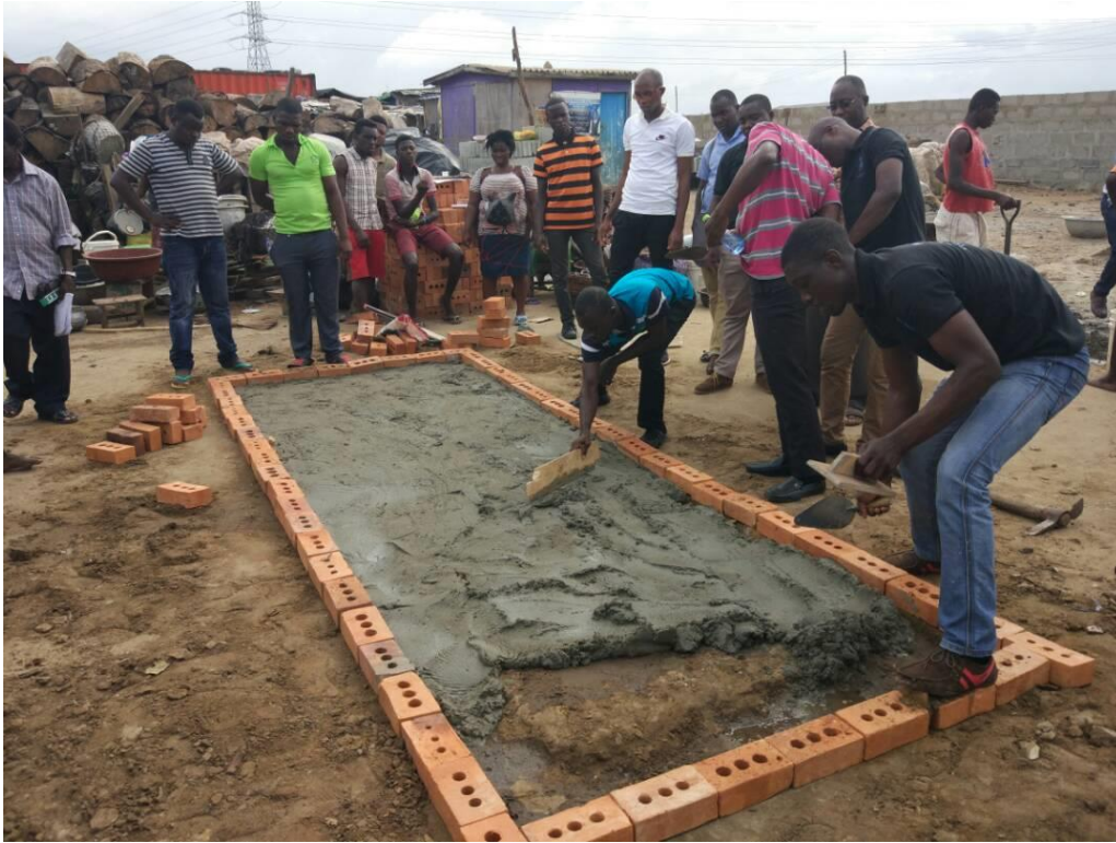
Figure 10 Participants of the technical training constructing samples of the Ahotor oven to the new specifications

There was a discussion as to whether there is the need to continue or discontinue with the downdraft design. The committee agreed to discontinue the technology due to associated complications and its inability to function after series of readjustments and reviews. The committee also referred to recommendations from Christa as valid for withdrawing investment into the technology.