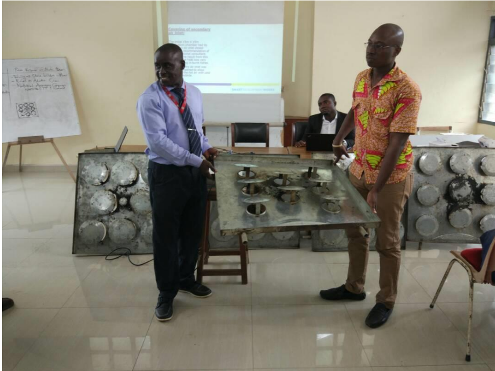
Figure 9 Showing committee members with the various types of fat collectors designed for the test

On the combustion chamber, the chamber has been reduced from 17cm x 17cm to 15cm x 15cm to enhance heat ejection in the oven. Reduction in the combustion chamber resulted in well circulated heat as well as better heat ejection, with heat reaching the tenth tray.