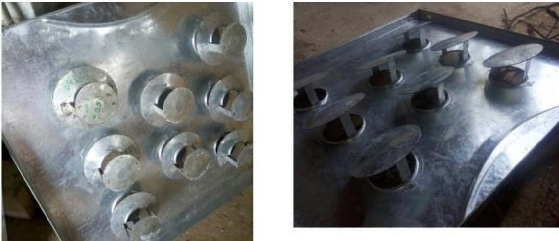
Figure 4 Fat collector with double mushroom head

In the attempt to solve the uneven heat redistribution in the smoking chamber, the design of the fat-collector was made to distribute evenly in the smoking chamber. To achieve this objective, series of designs were fabricated with varying dimensions and holes (See Figures 7 to 9).