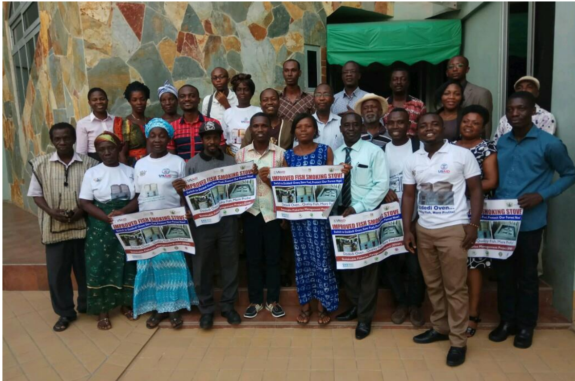
Figure 1 Participants of the first technology review meeting

Ahotor technology. Feedback from end-users together with testing information on energy assessment, PAH analysis as well as inputs from stove companies was discussed to clearly define the way forward. The review and brainstorming meeting was organized in January 2017 with a total participation of 25 people (16 males and 9 females) across a range of stakeholders; CSIR-FRI, GSA, CSIR-IIR, SFMP partners, End-users, Gratis, FC, and Stove builders.