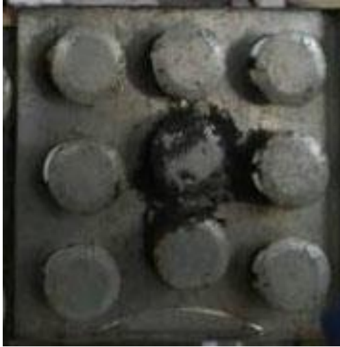
Figure 5 Fat collector with 9 mushroom heads