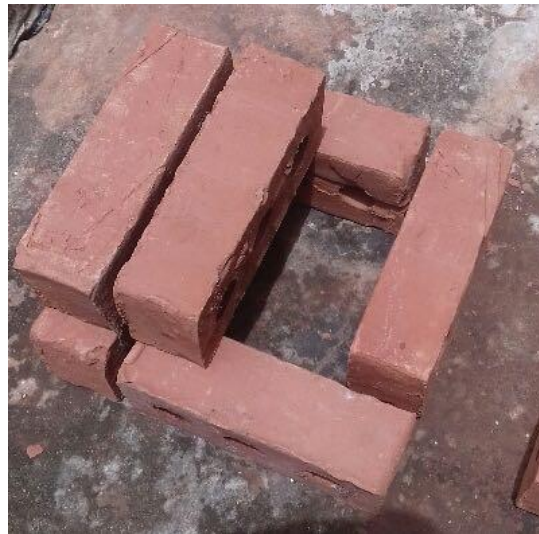
Figure 2 Four bricks on the edge of the combustion chamber to improve heat distribution

My suggestion there is to ‘cap’ the fire chamber on top to interrupt the upward flow of the flue gas and force it sideways. The available brick with the 3 round holes are ideal for that if they are put on edge like displayed in the photo. Then covered with a layer of bricks on edge maybe with some small gaps in between to form long and narrow slots for some flue gases to go up vertically if the area above does not get hot enough.