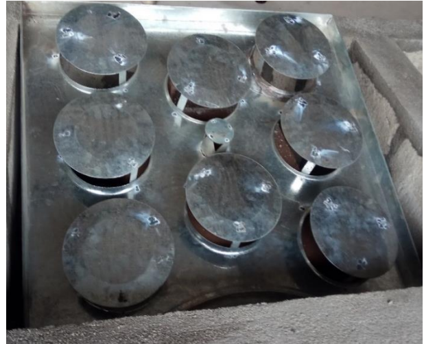
Figure 6 Fat collector with 8 holes and 6cm hole in the center

The main challenge of these designs was getting enough heat at the center of the oven. Inefficient heat at the center contributed to delay in cooking time. Figure 8 shows some of the different fat-collector designs fabricated in the course of the research. In figure 5, the mushroom-like cover plate on the fat-collector holes were slanted at an angle of 45°. The intention was to ensure heat redirection to enhance even heat distribution. This principle did not work because, the fish at the front row received more heat than necessary whereas fish at back row was got limited heat. To solve this problem, the trays needed to be constantly turned around to prevent burning at one side, adding up more task to processors.