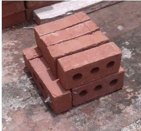
Figure 3 Four bricks sealing off the opening of the combustion chamber to improve heat distribution

Covered by 4 more bricks on edge with small slots to let some heat pass if needed