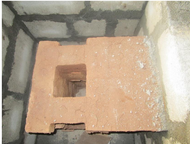
Figure 7 Combustion chamber of the Ahotor oven

Modifications were made to the combustion chamber to address feedbacks on prolonged smoking time and limited heat for bigger capacities at a go. The proposal from the technical team was to make the column narrower and circular. However, molding a circular column, was very difficult to achieve as it will increase the cost and time for construction. The inside dimension of combustion column was reduced from 17\text{cm}^2 to 15\text{cm}^2 to make it narrower using the same materials for construction. With this new dimension of the combustion column, the height of the stove could be reduced by 10cm which partly addresses the concerns raised on the stove height being high. Effecting this change to the combustion system resulted in an improved heat ejection velocity up to the tenth tray. It also significantly improved the cooking time with the Ahotor oven.