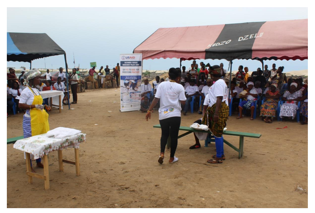
Figure 14: Some members of DOPA entertain the audience and a role play goo