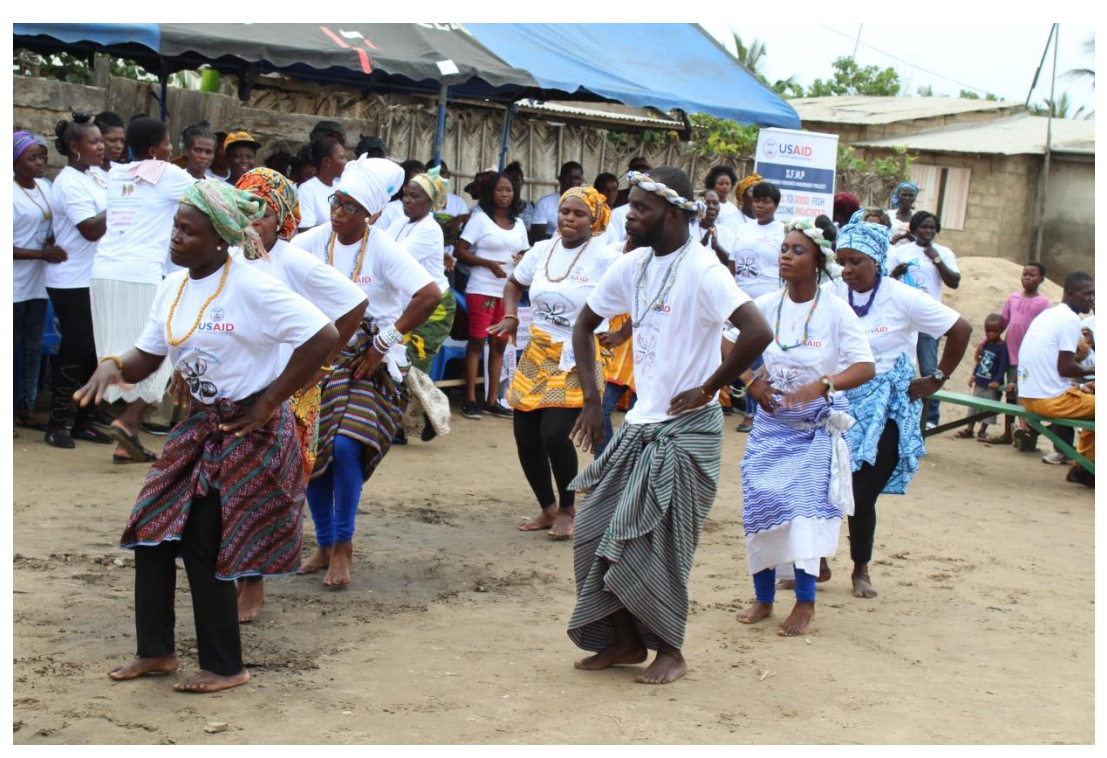
Figure 13: Some members of DOPA entertain in audience with a cultural dance.