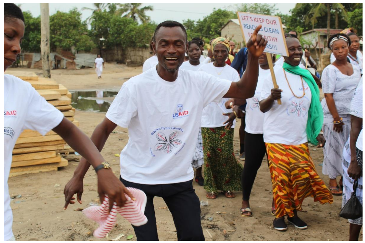
Figure 4: Members of DOPA on a street-walk.