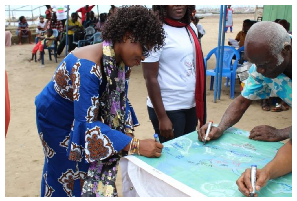
Figure 19: Representative from Ghana Education Service (Ga South Municipal) signing the compact.