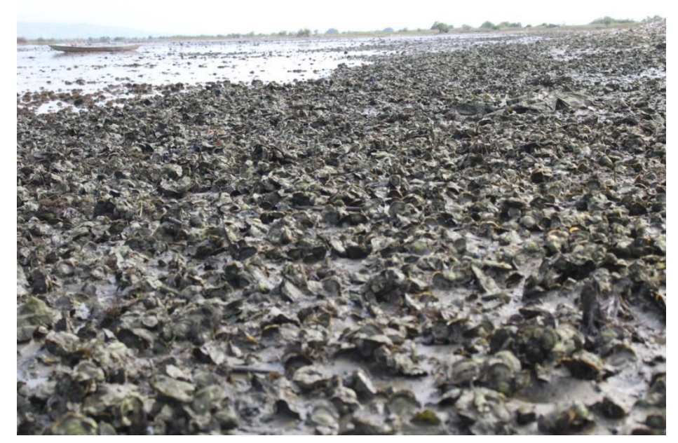
Figure 27: River bed of the Densu Delta at Tsokomey at low tide showing a boost in the oyster population after the closed season observance