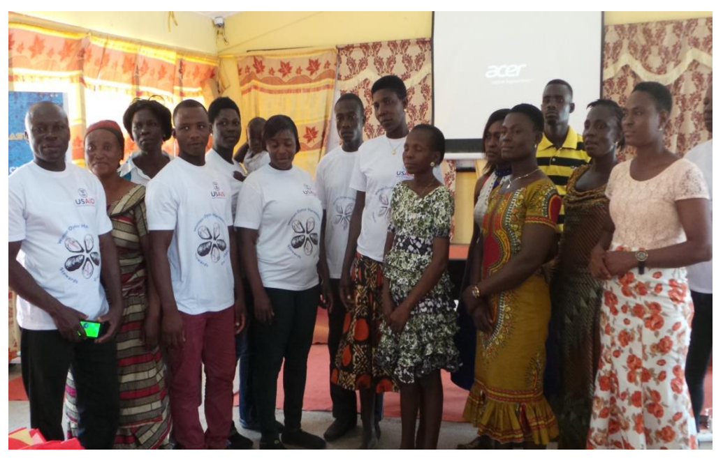
Figure 31: Members of the 15 member Densu Delta Co-Management Committee