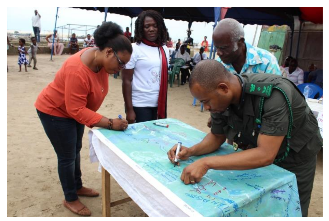
Figure 18: Other stakeholders including Fisheries Commission officers, Forestry Commission (Wildlife Division), Traditional leaders take their turn