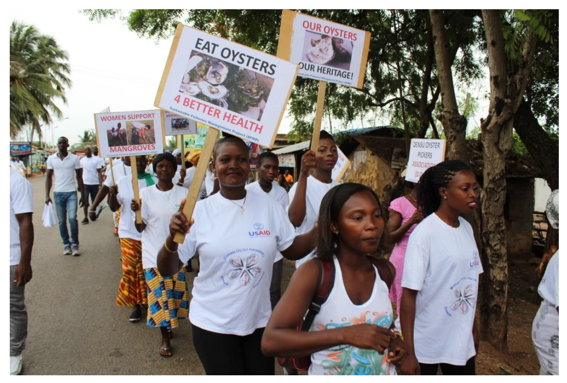
Figure 2: Members of DOPA with their placards during the float.