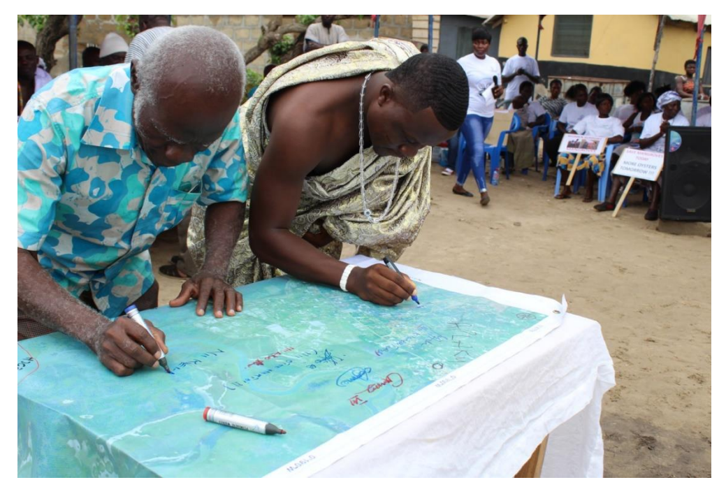
Figure 21: The Chief Fisherman of Kokrobite (right), representing fishers in the areas signs the compact.