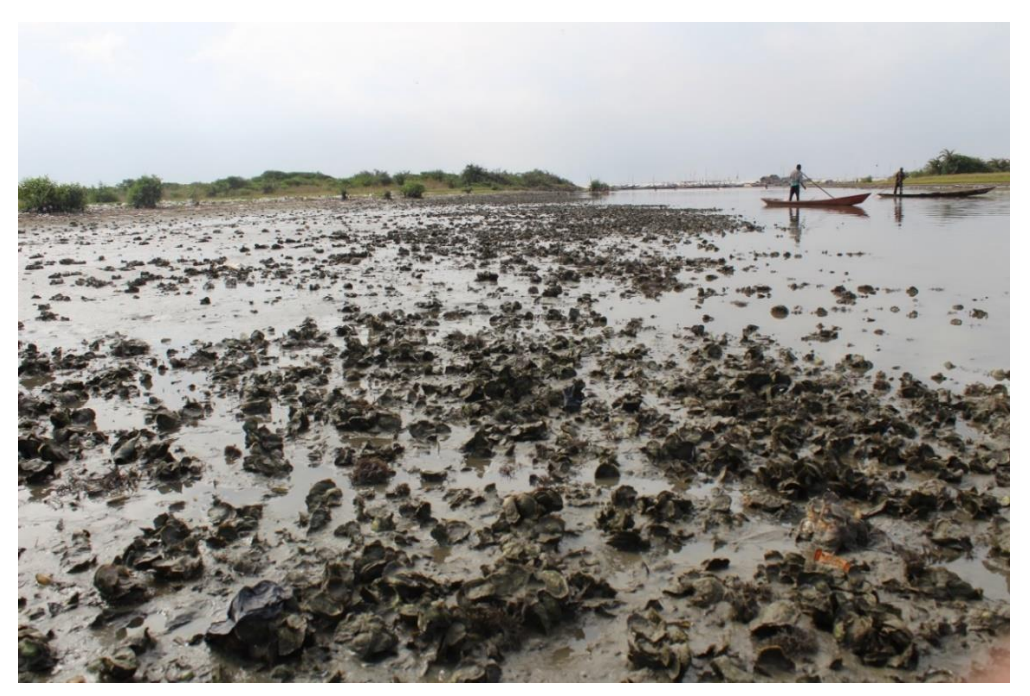
Figure 28: River bed of the Densu Delta at Tsokomey at low tide showing a boost in the oyster population after the closed season observance