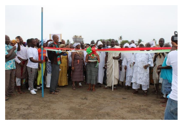
Figure 22: The SakumoWe of the Densu River flanked by the "river priest" Wulomo and other traditional leaders present officially cut the ribbon to signal the beginning of the oyster harvesting activities after the closed season observance.

This was done to institutionalize the practice of closed season on the Densu Delta for oyster harvesting activities during the period set aside by the Densu Co-Management committee. The SakumoWe who is highly revered among the community members led this activity in order to heighten the stature and increase self-compliance among the community folks.