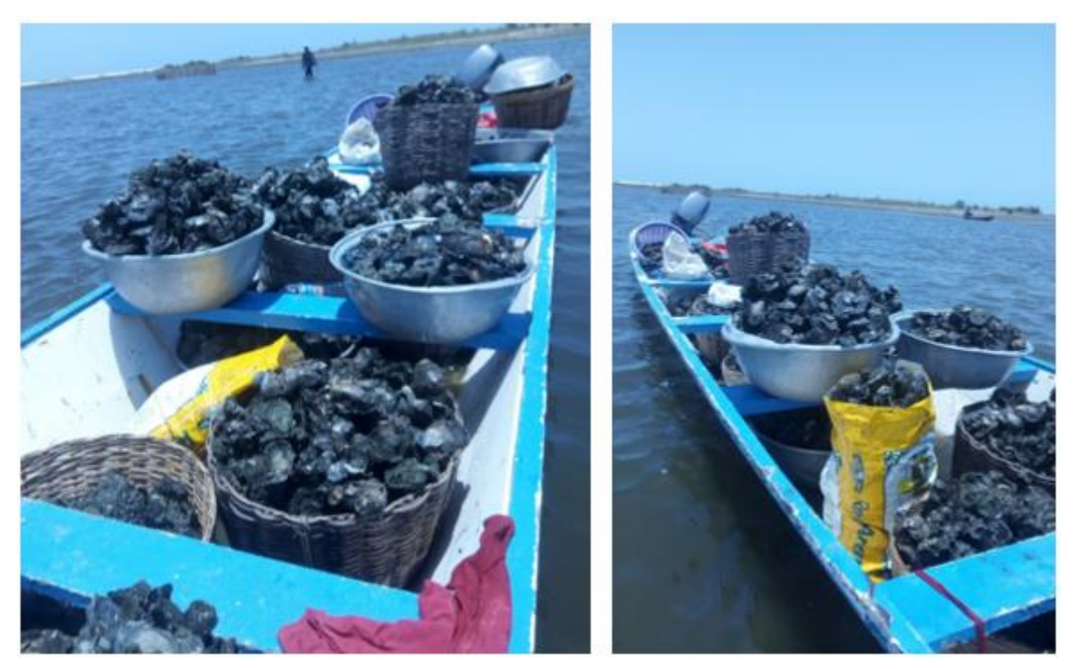
Figure 29: Harvested oyster at the Densu Delta after the opening.