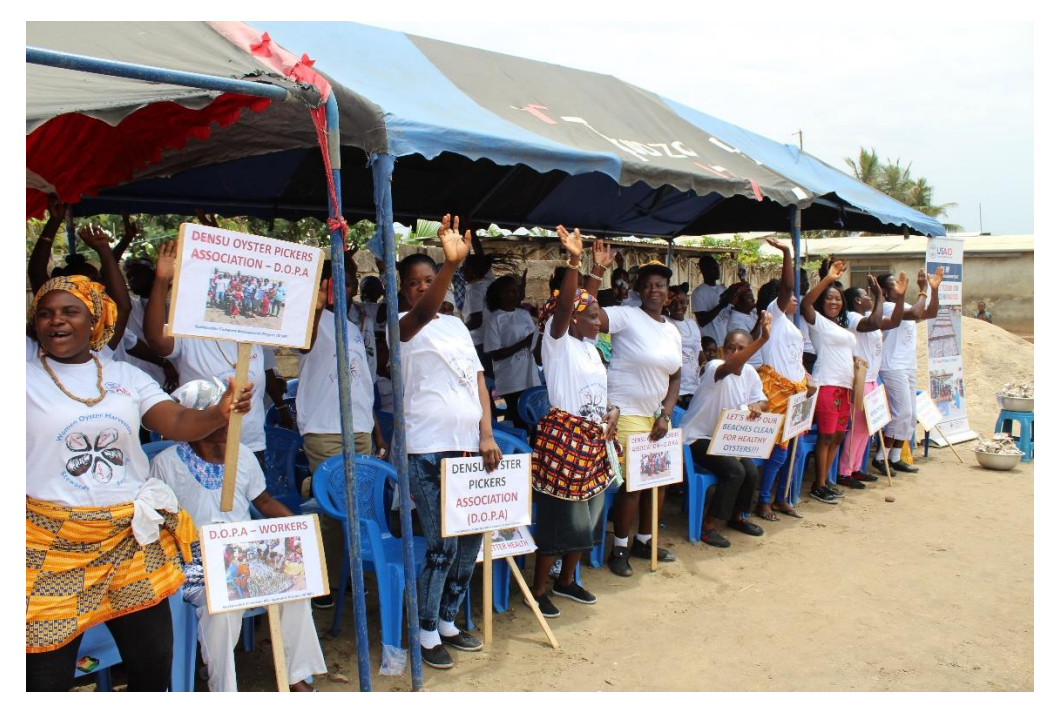
Figure 17: Members of DOPA, in solidarity show by hand their commitment to adopt and implement the plan