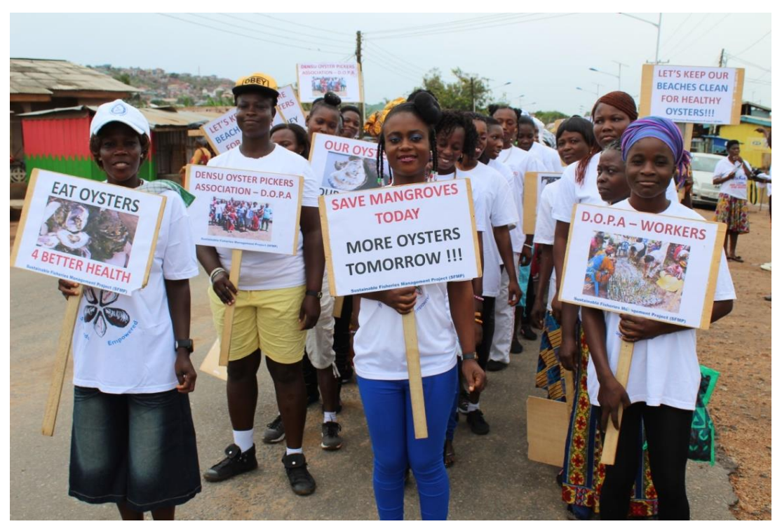
Figure 3: Section of members of DOPA on the walk.