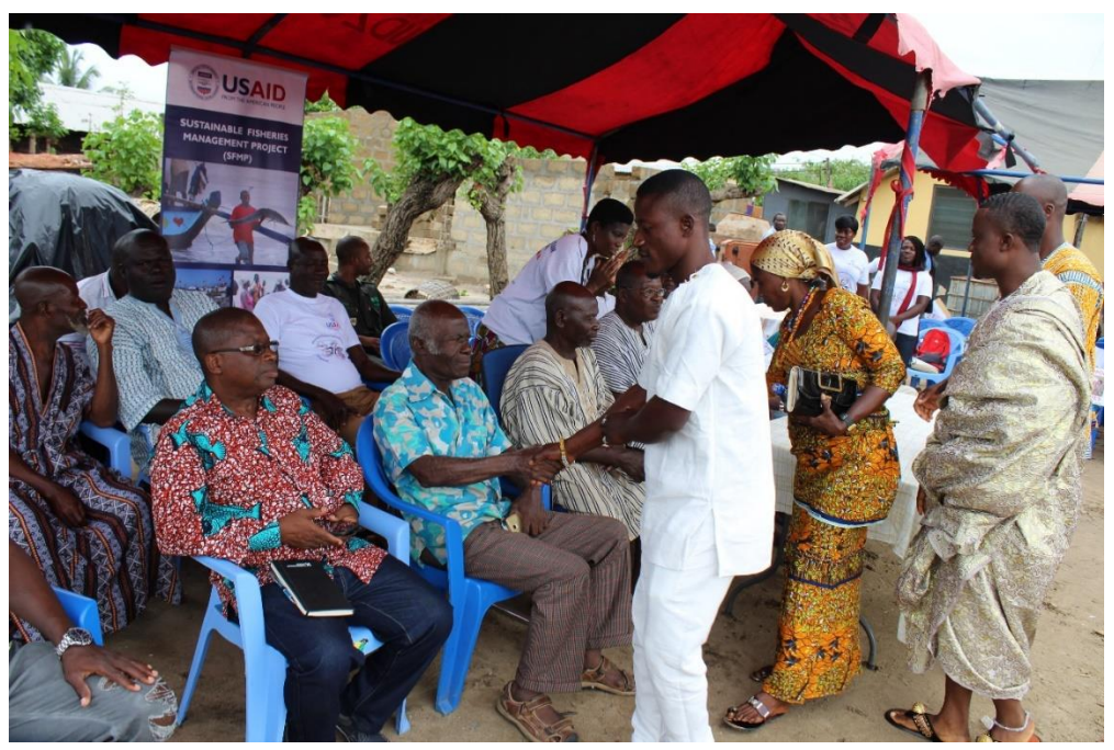
Figure 1: Cross section of stakeholders invited to the event.