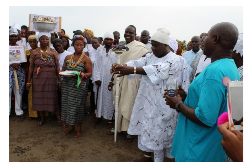
Figure 23: The SakumoWe, pours libation, thanking and asking the "gods" for a bumper oyster harvesting season as he declares the delta open for oyster harvesting activities

Figure 22: The SakumoWe of the Densu River flanked by the "river priest" Wulomo and other traditional leaders present officially cut the ribbon to signal the beginning of the oyster harvesting activities after the closed season observance.