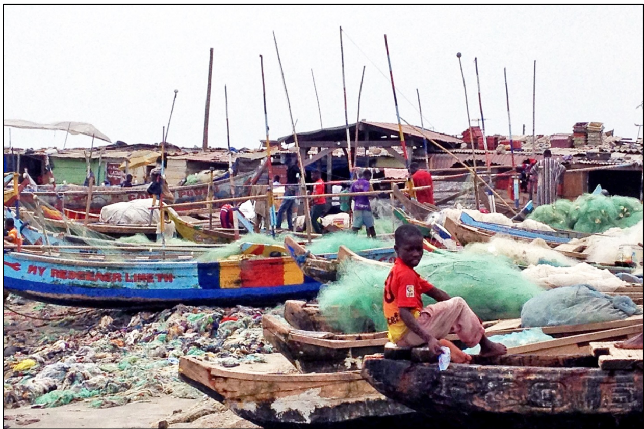
Boys work informally on fishing boats diving, bailing water, carrying gear, etc.

Ghana’s fishing industry comprises coastal fishing, which occurs in the Gulf of Guinea along the coast spanning the Central, Western, Volta, and Greater Accra regions of Ghana; and inland fishing, which takes place along the Volta river covering parts of the Brong, Ahafo, Northern, and Volta regions of the country. According to the Ghana Child Labor Survey Report (2003), over 49,000 children are involved in fishing in Ghana: 87% boys 13% girls. Many trafficked children end up in the fishing industry.