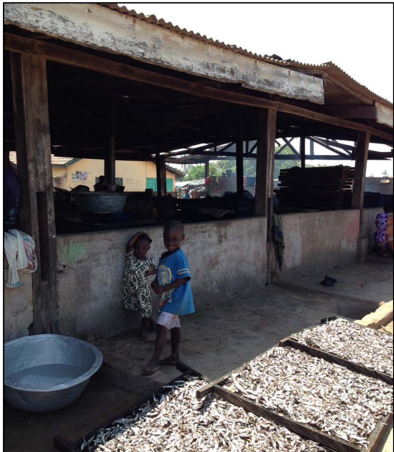
Migrant women and their children tend to work and sleep at the fish processing sites.

Fishermen in Ghana move along the coast to where fish is most abundant at any given time of the year. Some fishermen come with their own canoe and might hire a local crew, whereas others migrate to work as crew on local fishing vessels. Migration is seasonal and fishermen tend to spend at least part of the year at their home base. Migrants are generally well accepted in the local fishing village as long as they pay their respects to the chief fisherman, including paying a fishing fee or providing the chief with a “beach drink.” If the family does not accompany a fisherman, he has to rely on a local woman to be his business manager. The manager or “fish mother” helps the fisherman with everything from finding accommodation and introducing him to the chief fisherman to advancing money for fuel or gear repairs. The fisherman in turn sells his catch to the local fish mother.