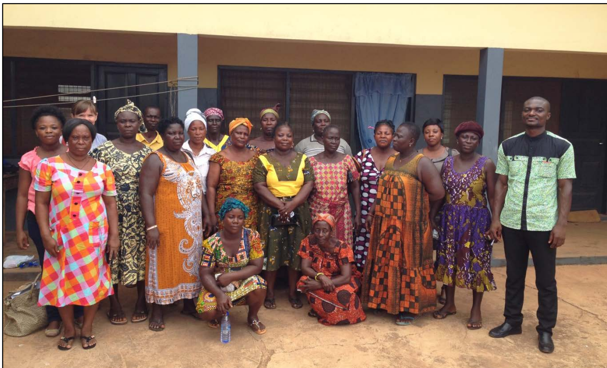
Women participate in a focus group in Axim.

The assessment is based on rapid and cost effective methods that match the scope of the gender analysis activities. The gender analysis is based on primary and secondary data. The team conducted a literature review of gender and fisheries in Ghana. The involvement of women in the fisheries value chain in the Central and Western Regions of Ghana is relatively well researched (see list of references) with a number of research studies conducted in the 1990s and mid-2000s. Primary data was collected through focus group discussions with women fish processors and traders as well as fishermen in Elmina, Apam, and Winneba (Central Region) and Axim (Western Region). Appendix 1 provides a list of sites and groups visited, and Appendix 2 includes the focus group questionnaire. The assessment team also visited fish landing sites and fish processing areas, where we observed the behaviors and roles of men, women, and children. Key informant interviews were conducted with the leader of CEWEFIA, a former canoe owner, the chief fisherman from Axim, the National Best Fisherman and the chief fisherman of Apam, the konkohen (head of the fish sellers and processing group) at Winneba, and staff of Friends of the Nation, which is working on the Child Labor and Trafficking (CLaT) component of the SFMP.