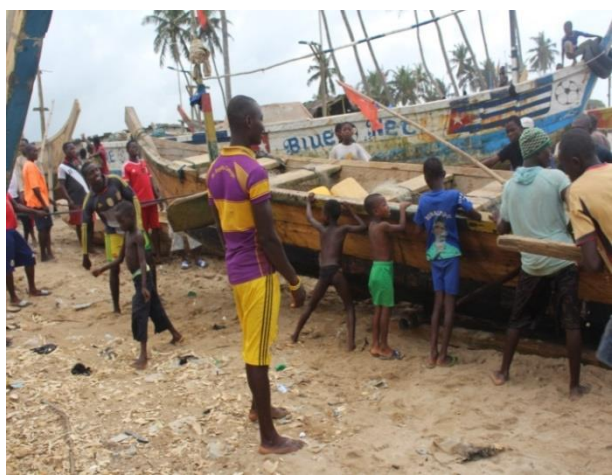
Figure 5. Under-age children working alongside adults on the beach