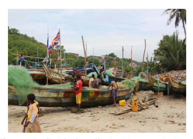
Figure 7. Pupils loitering off school hours at the beach