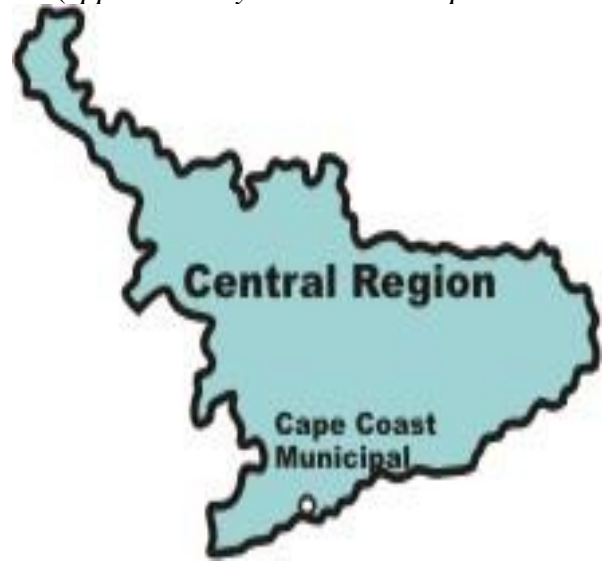
Figure 2. Central Region

Participatory Rural Appraisal (PRA) was employed for the assessment of the CLaT issues in the C/R. The process involved scoping visits and households survey in communities in the central region. Also key stakeholder informant interviews were conducted to gather as much as possible available information of CLaT. In all a total of 762 households were interviewed within the 35 communities ( approximately 22 households per community ).