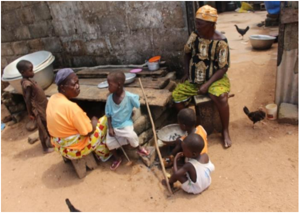
Figure 4. The elderly working for doles of fish and grandparents keeping the fort in the absence of the youth