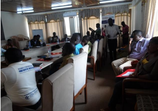
Figure 1. A cross section of the participants

Other issues that the media gathering were briefed on in the area of CLaT within fisheries in the C/R included: