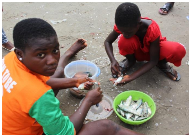
Figure 6. Children gutting fish paid them to sell