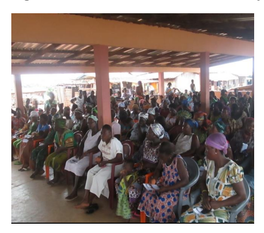
Figure 10 Community members listen to presentation.