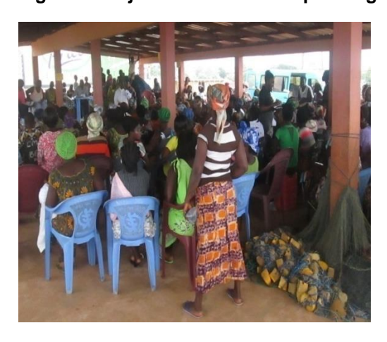
Figure 8 Community members listen to project coordinator.