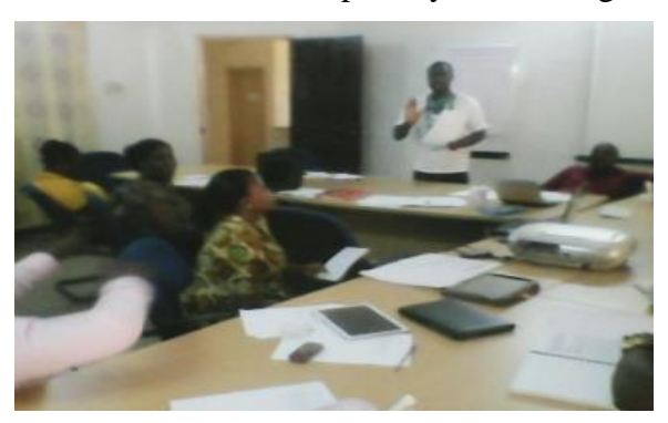
Figure 1 A Joint planning meeting between Daasgift and CEWEFIA, facilitated by Field Activities

In line with Daasgift deliverables under intermediate result 4.8.2(IR4.8), Fishery-based MSMEs identification and mobilization exercise was carried out on Ankobra estuary and Shama Old Town. Prior to the exercise, a joint planning meeting was organized between Daasgift, CEWEFIA and Hen Mpoano to design an identification and screening guide, a common tool to be adopted by both Daasgift and CEWEFIA in the identification process.