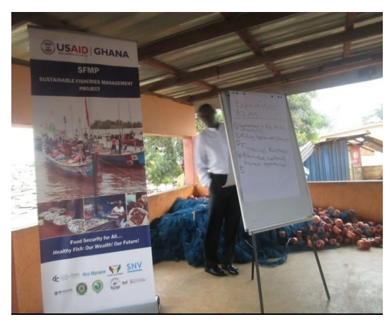
Figure 9 A mini durbar at Axim with Project Coordinator setting straight flipchart stand.