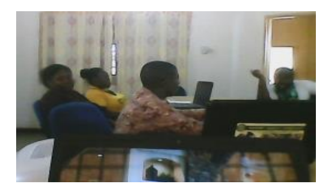
Figure 2 Manager, at Hen Mpoano