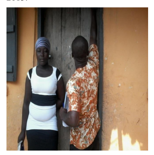
Figure 11 Project officers conducting MSMEs.

Daasgift followed up with verification of the selected MSMEs during focus group meeting to ascertain authenticity of information provided. The verification was carried out in all the three coastal communities, Shama (Apo and Bentsir), Sanwoma and Axim on 19 and 22 June, 2015.