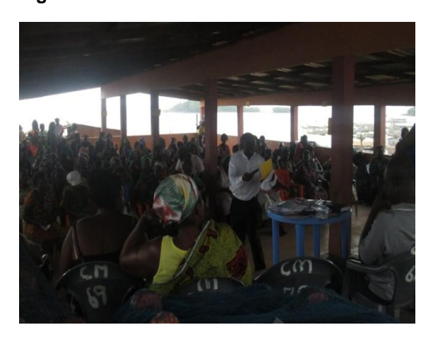
Figure 7 Project coordinator responding to an expectation by a member of Axim community