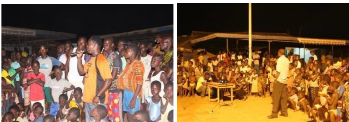
Stakeholders at IUU video screening

Two videos have been produced to support sustainable fisheries Management. One has been developed with key messages to reduce IUU fishing and promote more sustainable fishing practices. The second is a video on the Senegal - Gambia study tour that shares lessons learned of fisheries co-management in those countries as well as empowering women in fisheries management and post-harvest improvements.