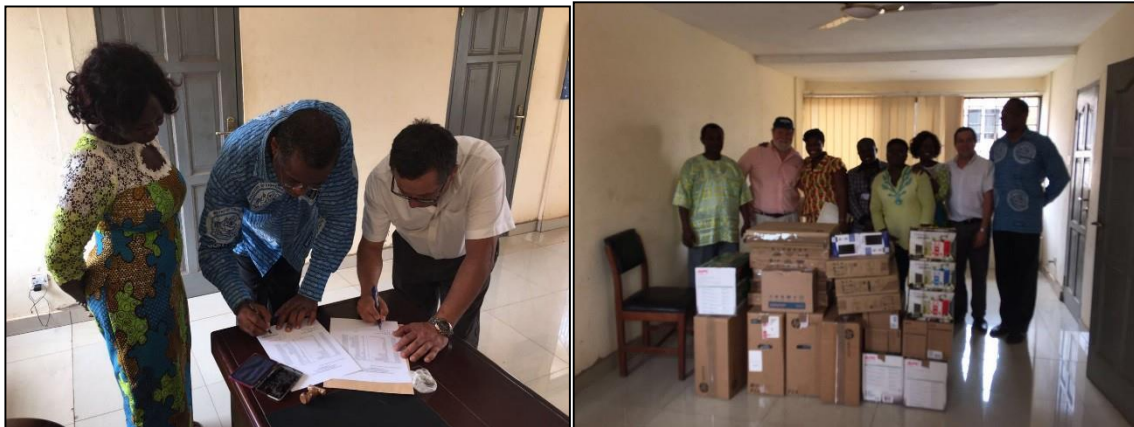
Photo: Delivery of IT and computer equipment to the Fisheries Scientific and Survey Division

The overall vision is to establish a local area network at the Tema’s FC headquarter to allow data exchange and data entry on a web-based database. This model will be later expanded to allow the regional offices to edit and enter data at the regional offices to increase efficiency and timeliness of the data entry and analysis for improving fisheries assessment and management.