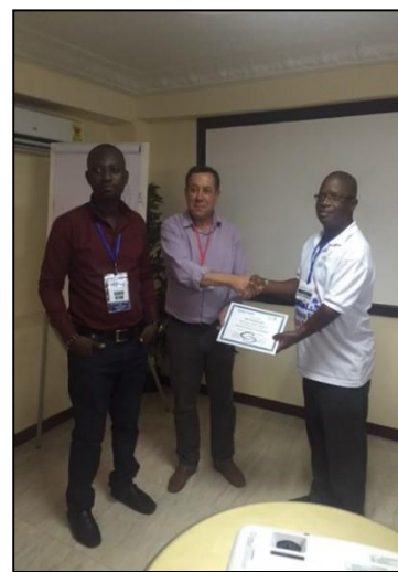
Photo: Participants at the biological fisheries sampling and databases workshop.

On the right, the Regional Director of the Greater Accra receiving a certificate of completion from the Senior Fisheries Advisor.