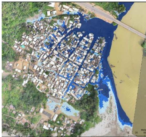
Visualizing food risks in Sanwoma based on flights with a UAV.

http://edc.maps.arcgis.com/apps/PublicGallery/index.html?appid=b4f53ef2fa3247f69db507a81d70ebc6