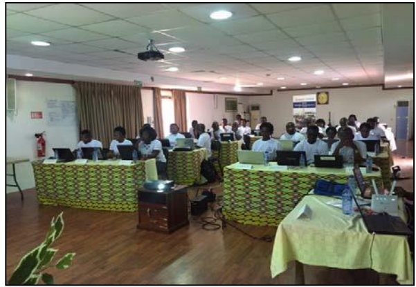
Photo: Participants at the Fisheries Data Collection Systems workshop