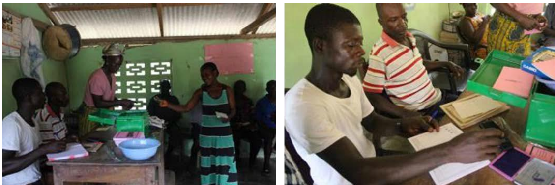
New village savings and loan has a meeting

These are the first of their kind within these communities and members are very excited about it.