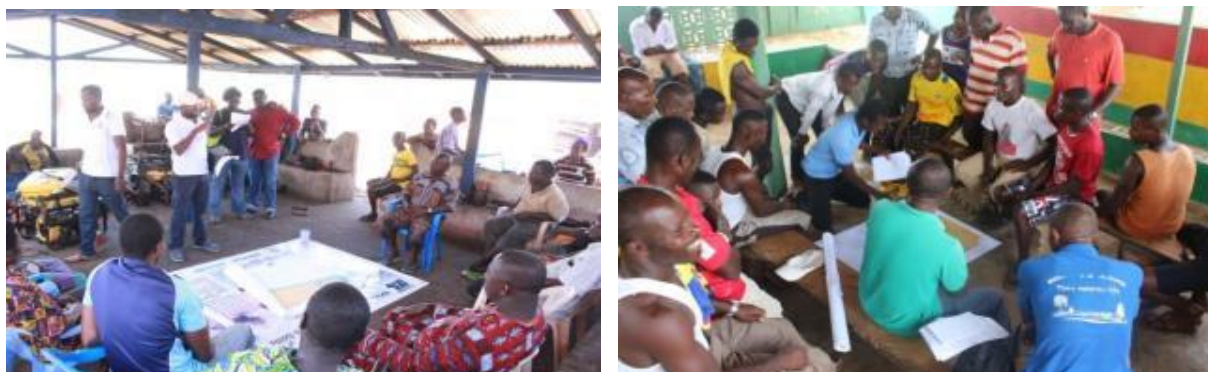
Local Ecological Focus Group Meetings in Moree and Half Assini

garnered from the FGD will be used to prepare questionnaires for detailed one-on-one interviews with fishermen and fish mongers. The outcome of the local ecological knowledge will be used to fill existing knowledge gap within the fisheries to compliment the available scientific information on life history parameters.