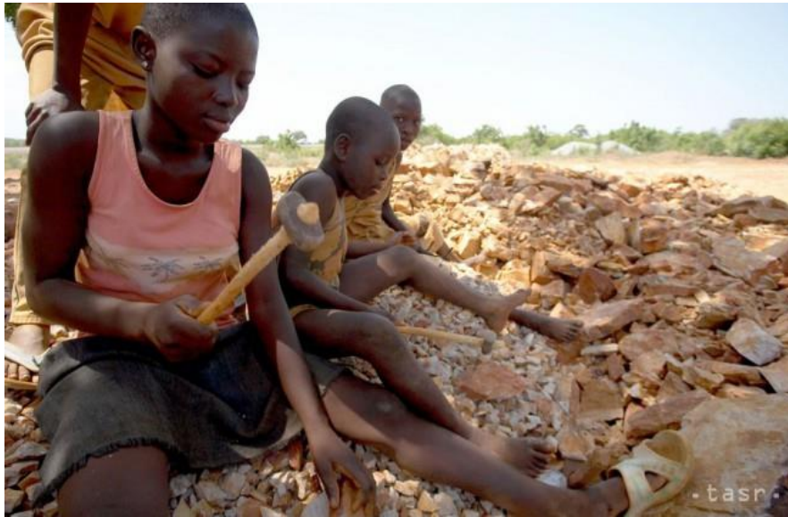
Figure 1. Children working in stone quarry

Participants were made to understand that, Child Labor and Trafficking (CLaT) deprives children of their basic rights and opportunities to free compulsory basic education. Such as seen in the pictures below;