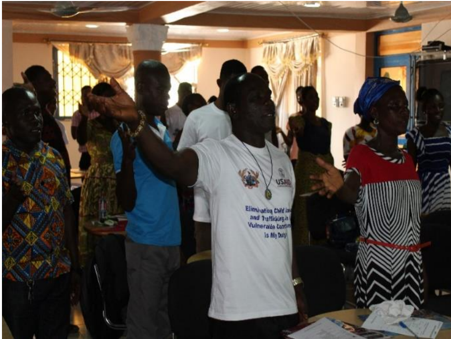
Figure 6. Community Advocates after the refresher training pledging to say “child labor away in my Community”