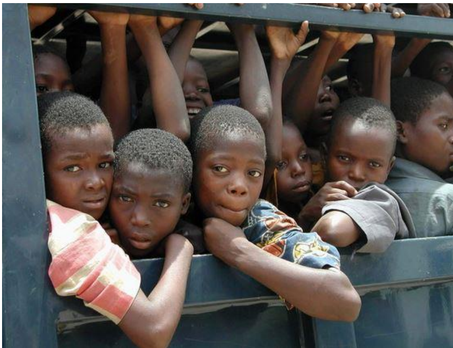
Figure 2. Children being trafficked