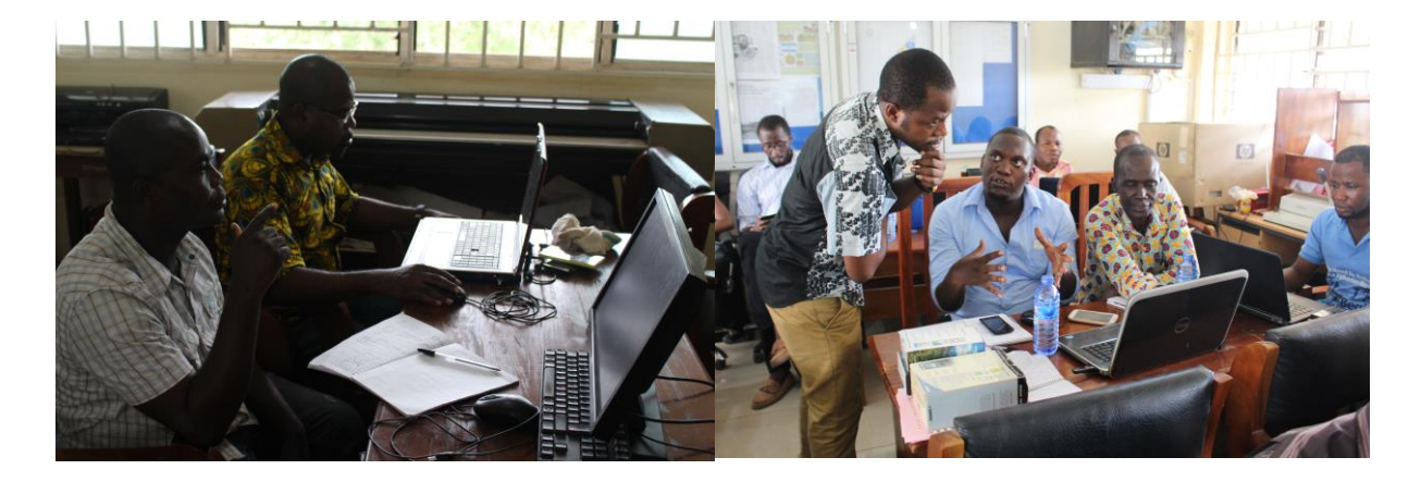
Figure 11 Participants asking questions and making contributions during training section.