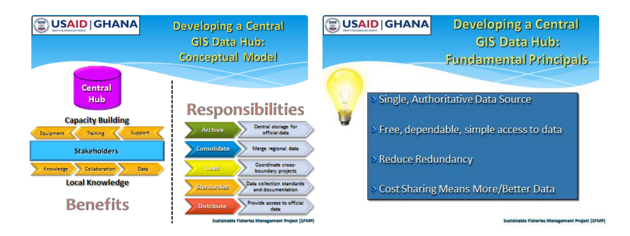
Figure 5 Selected slides from the presentation