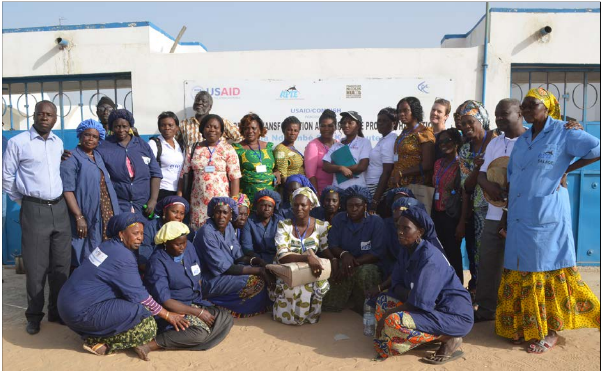
Figure 3. Cayar Women’s GIE members and study tour participants in front of the improved processing center. (Credit: Albert Boubane).

The study Tour concluded with a final session at the APTE office in Dakar. Participants reflected on lessons learned and worked in groups by type of organization to develop an Action Plan for implementation of priority actions upon their return to Ghana. The Action Plan is in Annex A. Section IV above summarizes key Lessons Learned. Details of Lessons Learned by type of organization are in Annex B.