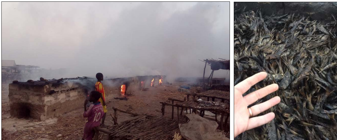
Figure 10. Smoking at Joal for export to the region (left). Juveniles preferred by neighboring country markets (right).

A few kilometers from the processing compound and closer to the sea, the study tour visited a large fish smoking area with more than 3000 open air smoking ovens. The site also had many warehouses made from flattened 200 liter barrels for the storage of smoked product for export to the West Africa region. Many of the warehouses were owned by foreigners (Cote d’Ivoire, Burkina Faso, Ghana). Massive smoking operations were going on at the site, with billows of thick smoke engulfing the entire site. Participants witnessed juvenile fish being braised. The visit to this site highlighted very dramatically the transition of fish smoking from an operation conducted largely by women and serving domestic markets to an operation dominated by men and influenced by significant market demand and money coming from West African buyers financing production for export to their countries. Juvenile fish are preferred in these markets. The situation also highlighted to participants the critical importance of strengthened governance structures like the CLPAs and the women’s GIEs to