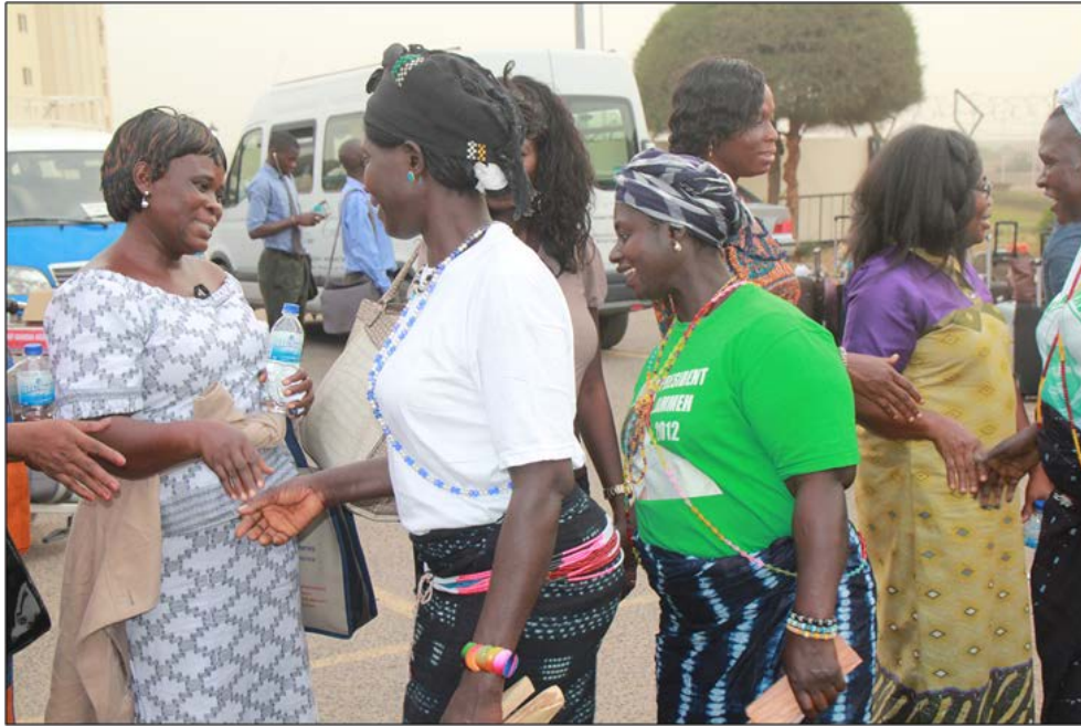
Figure 3. Study tour participants welcomed by TRY members at the Banjul airport, The Gambia.