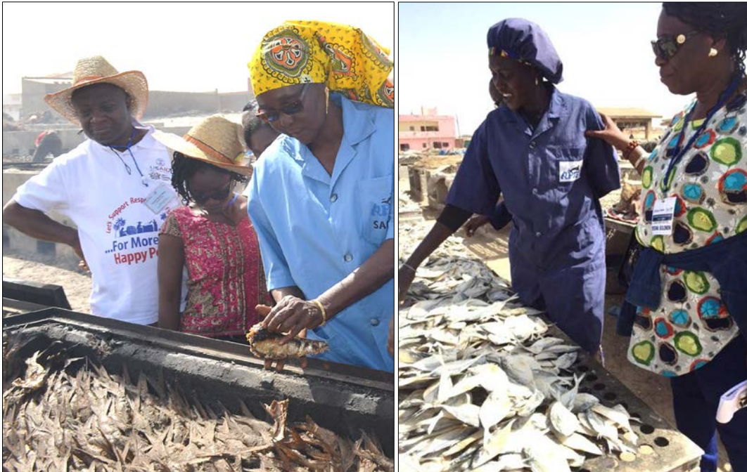
Figure 8. Cayar women’s GIE members explain their smoked (left) and dried (right) fish products processed at the site outside the improved processing center.

Cayar Improved Fish Processing Center: The same four groups were maintained for a tour of the COMFISH supported improved processing center. Highlights included: