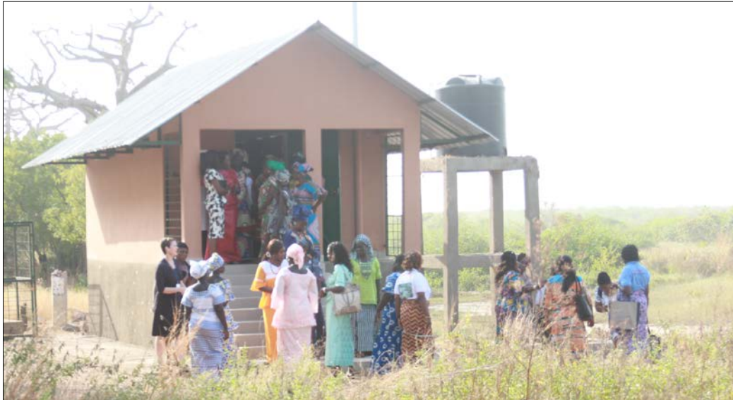
Figure 4. The tour visits WASH facilities at Kamalo oyster harvesting site.