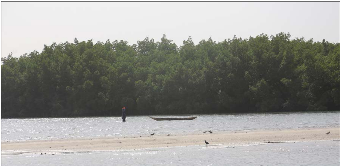
Figure 7. Participants saw oysters growing in the Tanbi and TRY women harvesting crabs during the 8 month closed season for oyster harvesting.

The economic activity of processing oyster and cockle shells into lime also brought up questions. Only women process lime. Men do not do it. Unfortunately, this profitable activity does not coincide with the closed season for oyster harvesting because it is the rainy season and lime must be processed during the dry season. The major constraint on lime processing is the cost and the availability of large diameter logs needed to create a fire that is hot and long-burning enough. The production process takes 6 days: 3-4 days for burning, a day to add fresh water to break the burned shells down, 1-2 days for cooling, picking out whole shells, sifting and packaging. The women claimed that one batch can produce 60 bags sold at approximately $2 US per bag = $120. For marketing, some buyers come to the site, but those who use lime to make tiles are nearer to Banjul and do not come. The women pay 25% to outlets near Banjul who market their lime.