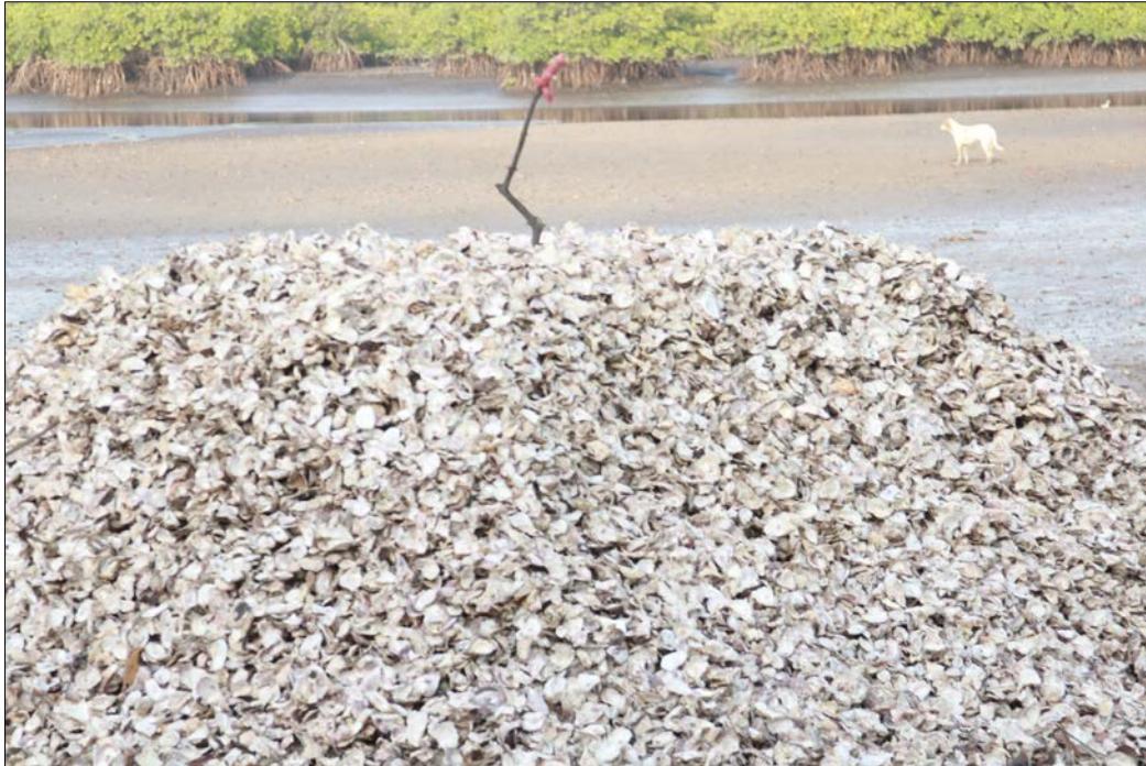
Figure 5. Oyster shells are “banked” by each harvester and sold for uses such as paving material and processing into lime.