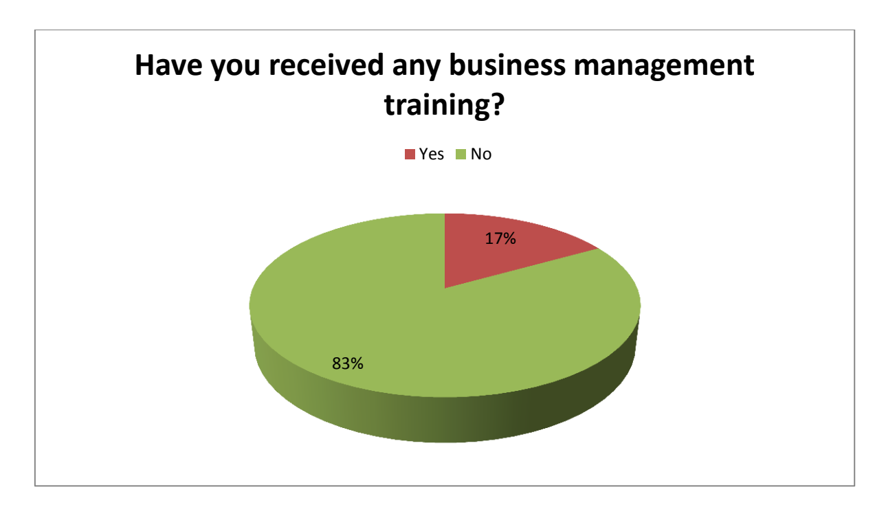
Figure 2 Questionnaire Response 1