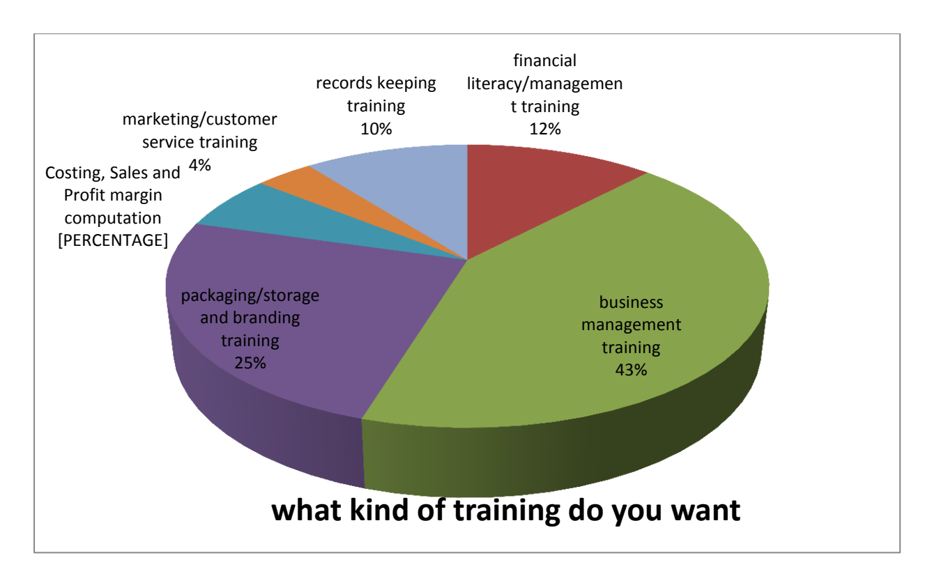
Figure 4 Questionnaire Response 3