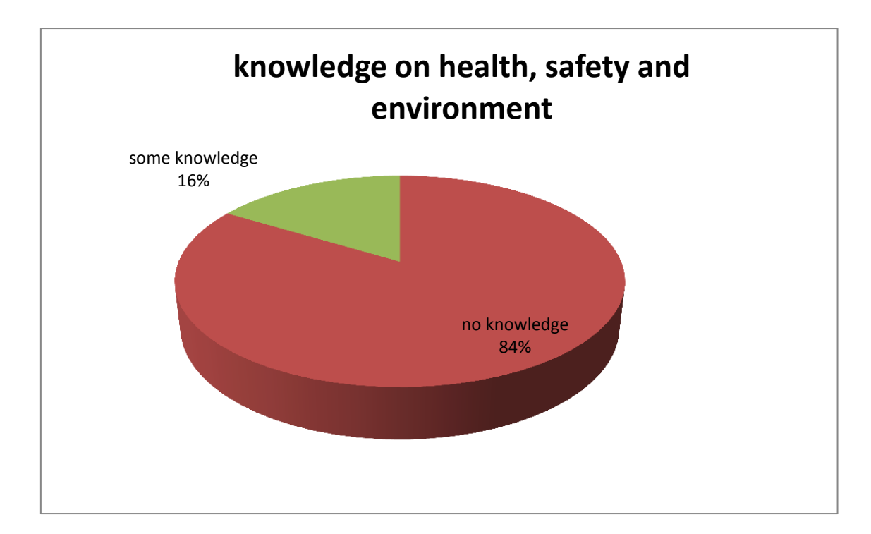
Figure 5 Questionnaire Response 4