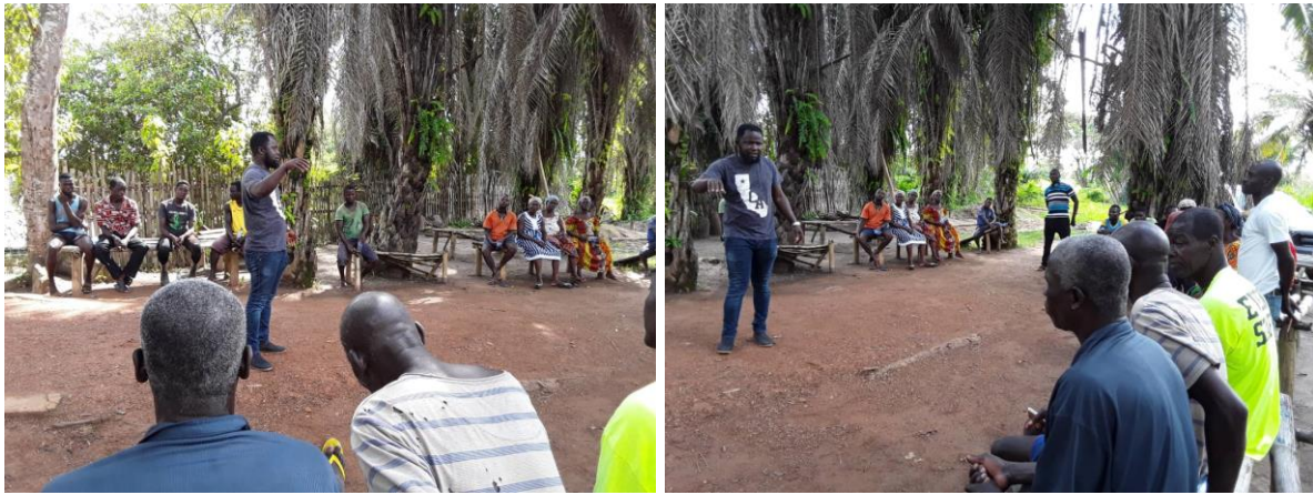
Figure 4. Facilitator using gestures to illustrate and explain a point to participants

Mangrove harvesters are now sensitized and educated to use mangrove resources sustainably. They expressed satisfaction with replanting efforts already conducted in cleared zones. They promised to utilize the skills they had acquired through the training to ensure that the mangroves resources bequeath to them by their forefathers are utilized in a way that their offspring would also be able to benefit from the resources. They however asked that public education be intensified to ensure voluntary compliance by mangrove harvesters in other communities fringing the Ankobra Estuary. They also asked that replanted areas be identified and marked as conservation site to ensure proper restoration and regeneration. They also asked that some form of accreditation be given to mangrove harvesters who harvest mangroves in a sustainable way to serve as an encouragement to other harvesters.