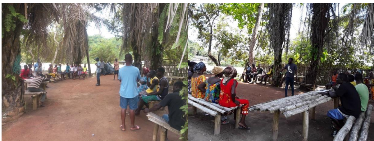
Figure 2. Section of mangrove harvesters during 1 st and 2 nd training respectively

The participants were introduced to the need for sustainable use of mangrove resources, and some techniques for effective harvesting of mangroves, their resources and management. The training also highlighted important clues to ensure effective and sustainable use of mangrove resources. Highlights included sustainable harvesting technics, mangrove nursing and direct planting methods, spacing of harvesting grounds and delineation of a no-cut-zone along the riverbank. The training is expected to equip harvesters to utilize mangrove resources sustainably.