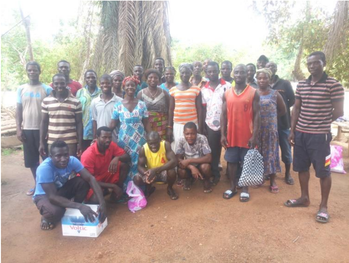
Figure 1. Group picture of first participants trained

The participants were introduced to the need for sustainable use of mangrove resources, and some techniques for effective harvesting of mangroves, their resources and management. The training also highlighted important clues to ensure effective and sustainable use of mangrove resources. Highlights included sustainable harvesting technics, mangrove nursing and direct planting methods, spacing of harvesting grounds and delineation of a no-cut-zone along the riverbank. The training is expected to equip harvesters to utilize mangrove resources sustainably.