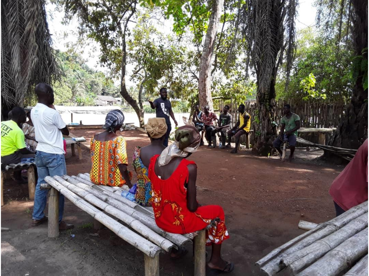
Figure 3. A facilitator addressing the participant

The mode of training was mainly presentations by experienced facilitators. Participants had the opportunity to ask questions and make contributions. Suggestions on what can be done to sustainably use mangrove resources were also gathered from the participants.