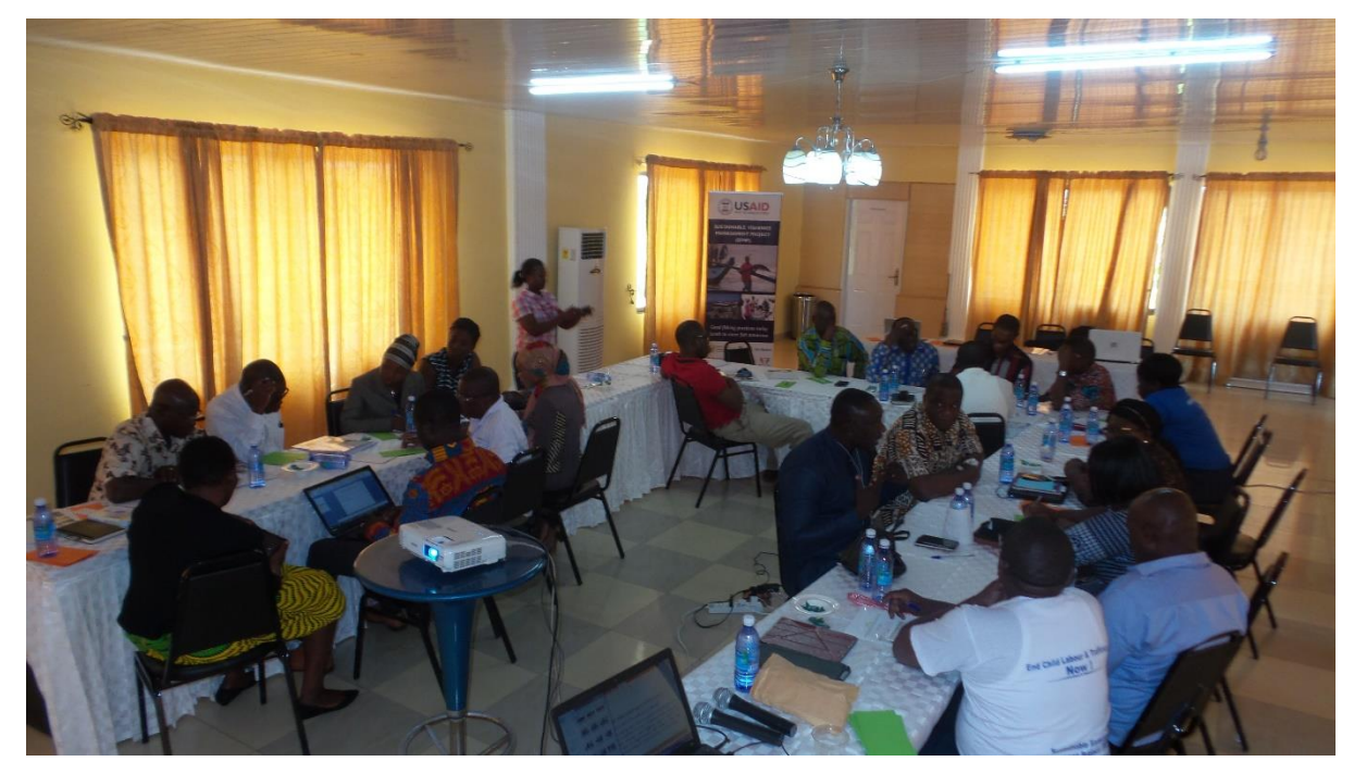
Figure 10. Cross section of participants during group discussion