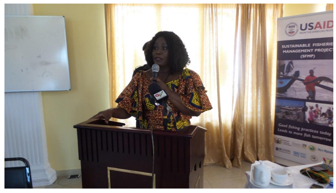
Figure 1. Hon. Elizabeth Naa Afoley Quaye, Minister of MoFAD giving the key note address