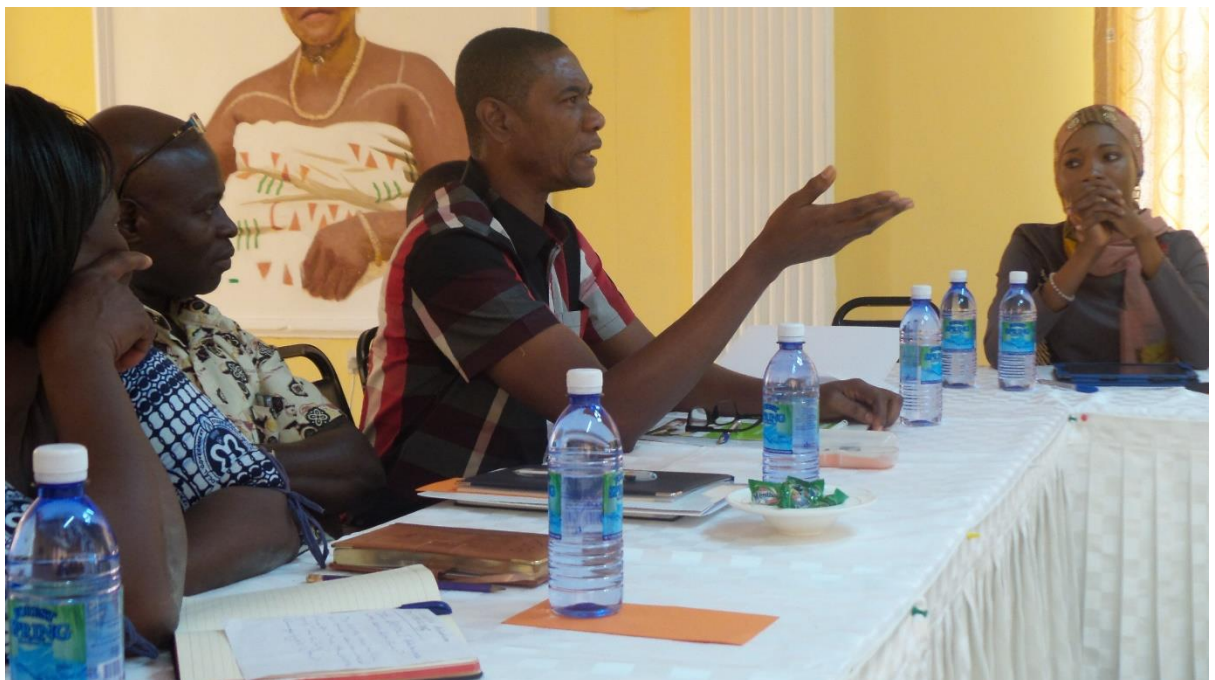
Figure 6. A participant sharing his CLaT experiences from his region