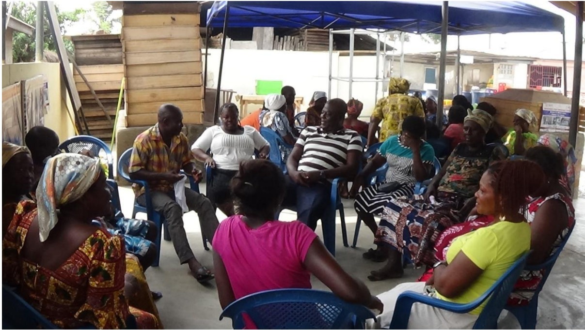
Figure 1. Participants in a group discussion

Finally, a role play was performed to show the importance of good record keeping in a business enterprise. One fish processor summed it all up by saying, “I will no longer just buy fish, smoke and sell but would rather have an objective to grow my business and save towards its expansion in subsequent years”.