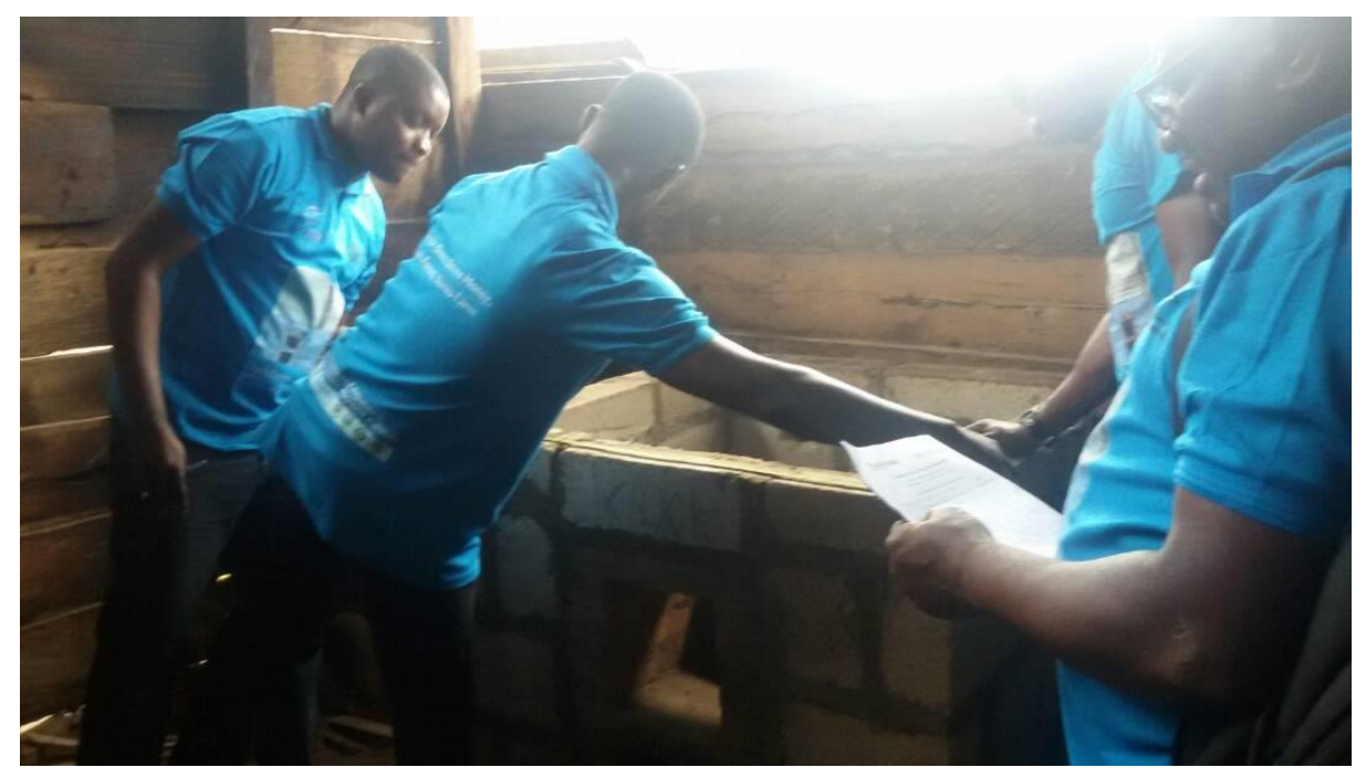
Figure 3 Field demonstration and physical measurement of Ahotor oven using checklist

Financial Institutions have the responsibility to monitor and evaluate the performance of the ovens to enable them validate justification for the issuance of the 30% final payment to stove companies. To equip them to carry out this task, a field demonstration was organized to conduct physical measurement on the various components of the oven as a means of verifying the performance of the Ahotor oven. They were also trained on other indicators that shows that the stove is complete. These indicators may include, the combustion grate, fat-collector, the hood and trays if applicable. A checklist has been developed for this purpose to facilitate the process.