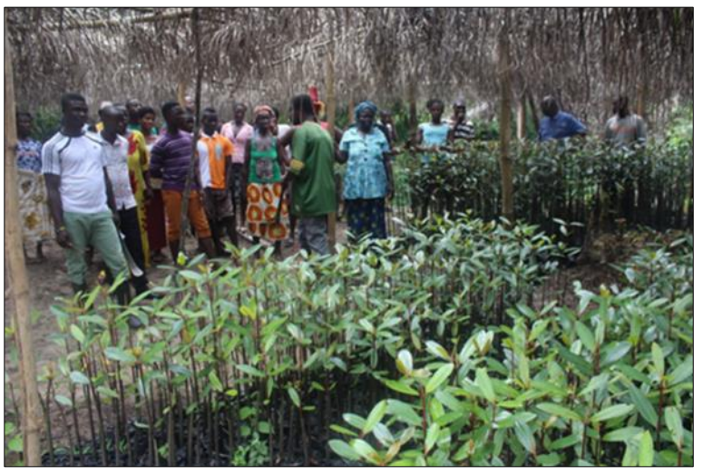
Figure 2. Anyanzinli mangrove nursery under discussion on the CSLP Media Day 2017

A total of 11 officials (7 men, 4 women) representing the institutions listed above were present. The Forest Services Division of the Forestry Commission, named as a stakeholder by the Government of Ghana at the beginning of the project in 2013, is chronically absent (despite many personal invitations and efforts on the part of the project). Along with the updates on the CSLP's activities, the regional stakeholders provided comments and recommendations to further strengthen the projects activities. A sampling of these is noted in Table 5.