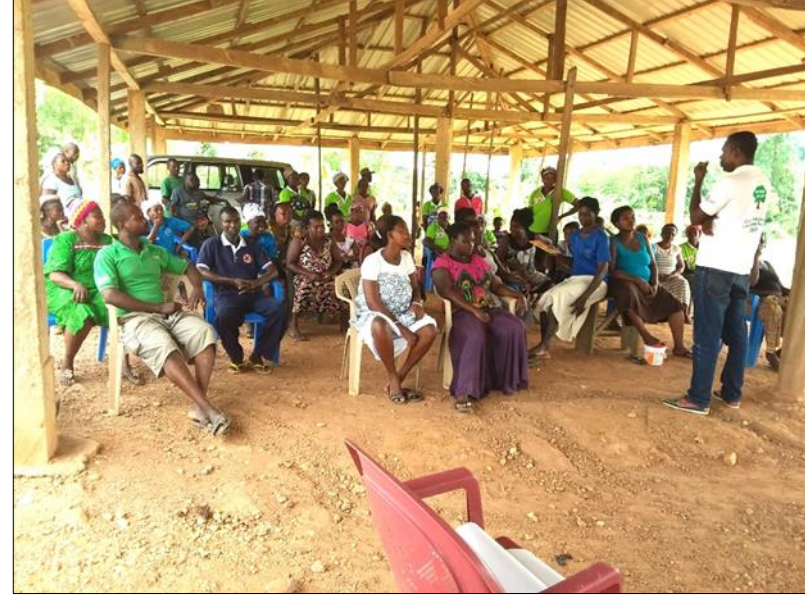
Figure 11. Meeting discussing women's challenges to accessing land for agricultural purposes at Asonti in the Nzema East Municipality

Project staff worked to follow through on the work of the gender consultant and completed the CSLP Gender Integration Framework (GIF). The framework emphasizes activities currently being implemented under the project's Annual Work Plan (FY 2018) and with other actions planned into FY 2019. The GIF was submitted to the AoR and the USAID/Ghana gender point