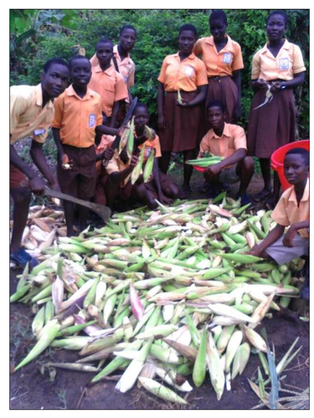
Figure 8. Maize harvesting by Komfeku JHS Climate Change Club in 2017

Planting for Foods and Jobs. The school, with the active support of the Parent-Teacher Association (PTA), is currently searching for a bigger plot of land to begin operation. As Ghana's economy is dominated by agriculture, employing over 40% of the working population, this intervention with the youth will contribute to addressing the food insecurity issues in the region and assist the government to further improve the contribution of agriculture to the country's Gross Domestic Product (GDP).