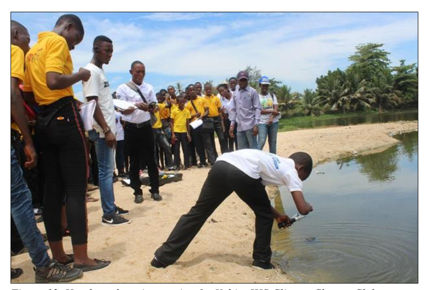
Figure 12. Hands-on learning session for Yabiw JHS Climate Change Club members during wetlands monitoring tour to Yabiw and Fosu Lagoons in the Central Region

The demand for scaling up and wider representation of CSLP's work with the Ghana Education Service and its support of climate change clubs has continued to