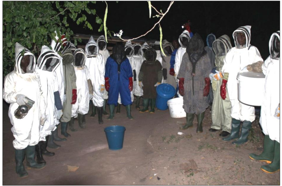
Figure 3. CSLP-supported beekeepers and some members of Atebubu Beekeepers Association

The project initiated the first of several discussions among 55 community members (41 women, 14 men) to assess their access to land for food crop production in Nzema East Municipality. The meeting brought together women and landowners (41 women, 14 men) to discuss challenges women face in accessing land for food crop production. In the Western Region, land for food crop production competes heavily with cash crops (e.g., rubber, cocoa, and oil palm) leaving food crop farmers at a disadvantage. Landowners present promised to make more land available to women for food farming. In Ghana, women make up about 50 percent of the agricultural labor force but own only about 10 percent of land. Evidence from elsewhere indicates that if these women had the same access to productive resources as men, they could increase yields on their farms by 20 to 30 percent, raising total agricultural output in Ghana by 4 percent. In turn, this would reduce hunger by 12 to 17 percent. Women are, however, constrained by the most vital resource to agriculture—land. The project will continue to hold these discussions in other communities. With active monitoring it is hoped to contribute to greater land security for women and help increase crop yield and food security in the communities on the landscapes.