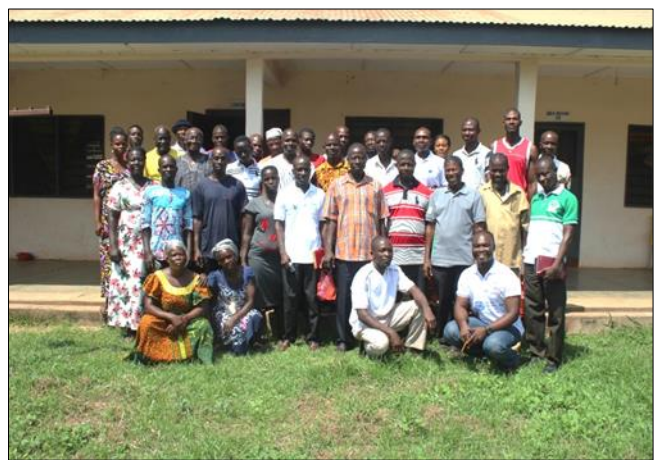
Figure 4. The CSLP-supported beekeepers together with members of Atebubu Beekeepers Association in the Brong Ahafo Region

In its quest to encourage farmers to practice reduced emissions from deforestation and forest degradation (REDD+), CSLP introduced beekeeping to the farmers within the six coastal districts in the Western Region. Beekeeping helps to diversify farmers' income through honey and other products' sales while also improving the