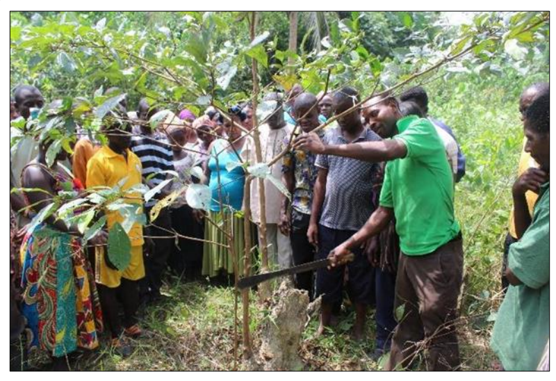
Figure 6. Participant demonstrating the process of singling at the CSTR training in Asonti

In order to extend the skills beyond the CSLP operational communities, all the extension staff of the CHED-COCOBOD from the Aiyinase Cocoa District (14 participants) and the Elubo Cocoa District (10 participants), both of which are parts of the Jomoro Municipal Assembly, participated in the training of trainers (ToT)