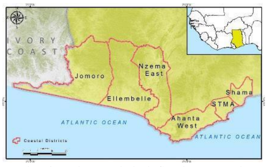
Figure 2. The six coastal districts in Ghana's Western Region

To confront these growing threats mentioned above, the CSLP is working to improve carbon sequestration, forest management, and livelihoods in the six coastal districts of the Western Region (see Figure 2). The overall long-term impact of the project will be to promote low emissions development in Ghana's Western Region by strengthening community-based natural resource management and monitoring . The project focuses on the coastal landscape, including mangroves, other wetlands, and forests and agricultural areas (within and outside protected areas) all of which are managed under a diversity of land tenure regimes.