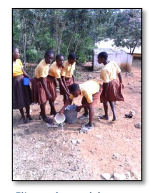
Climate change club members watering trees planted

Students could not hide their excitement as they shared roles they had played in the greening effort. "We brought loamy soil and animal droppings from our houses to fertilize places where we had planted the trees and grasses. We also brought buckets of water to water the trees and grasses regularly. This made it grow well," the students said.