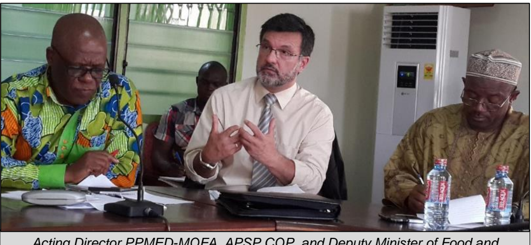
Acting Director PPMED-MOFA, APSP COP, and Deputy Minister of Food and Agriculture for Crops; meeting with Minister of Food and Agriculture – October 2014

In December, APSP met with the Minister of Food and Agriculture to discuss activities such as a meeting of the three Councils mandated by the Seeds and Fertilizer Act (Act 803). The meeting, which is expected to take place in the second quarter of FY2015, will serve as a foundation for APSP to initiate a training needs assessment and develop a capacity building training program for council members to increase their efficiency to oversee the implementation of Act 803. APSP also briefed the Minister about the upcoming soil fertility mission and study co-sponsored by IFPRI, WAFP and APSP. The Minister provided his full support to this initiative, which will provide the government of Ghana with policy options in soil fertility management.