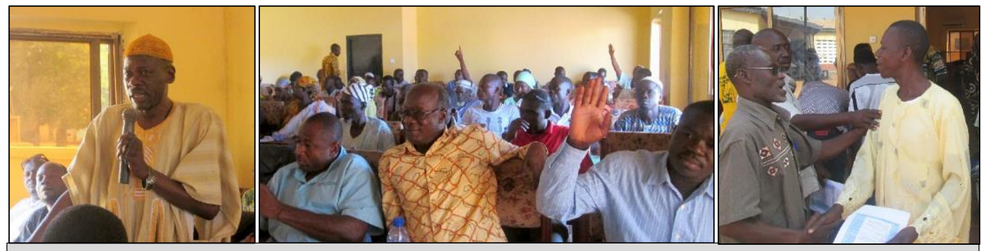
Participants and Discussions from Yendi Sensitization Forum in November 2014

At the start of the forums, APSP conducted a rapid assessment of the participants' knowledge and understanding of Ghana's agriculture policy. The assessment showed that more than 95 percent of the participants had no knowledge of Ghana's agriculture policy. Following the workshops, participants reported having a better appreciation of the policy environment and their role in the policy process. Based on the workshops, participants resolved to lobby their District Assemblies to establish separate agriculture sub-committees, and agreed to proactively engage with their Assemblies to provide input into agriculture policy issues. For example, participants from the Shai Osudoku district agreed to work together to advocate for agriculture land security and to work with local authorities to create an enabling environment for private investment in rice production milling and provision of services to smallholder rice farmers around the Asutsuare Irrigation project.