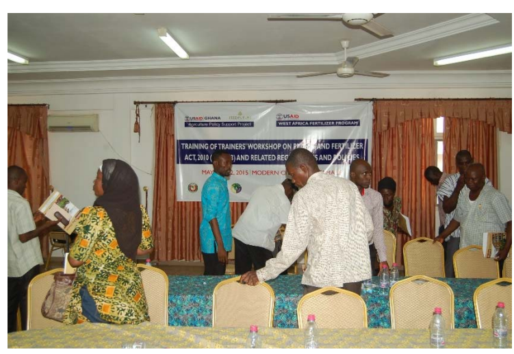
harmonize the Ministry's seed regulations Some of the Participants at the Tamale Training of Trainers in May 2015

Operationalize Input Regulations and Policies: APSP continued to provide technical assistance to the Directorate of Crop Services (DCS) of MoFA to harmonize the Ministry's seed regulation