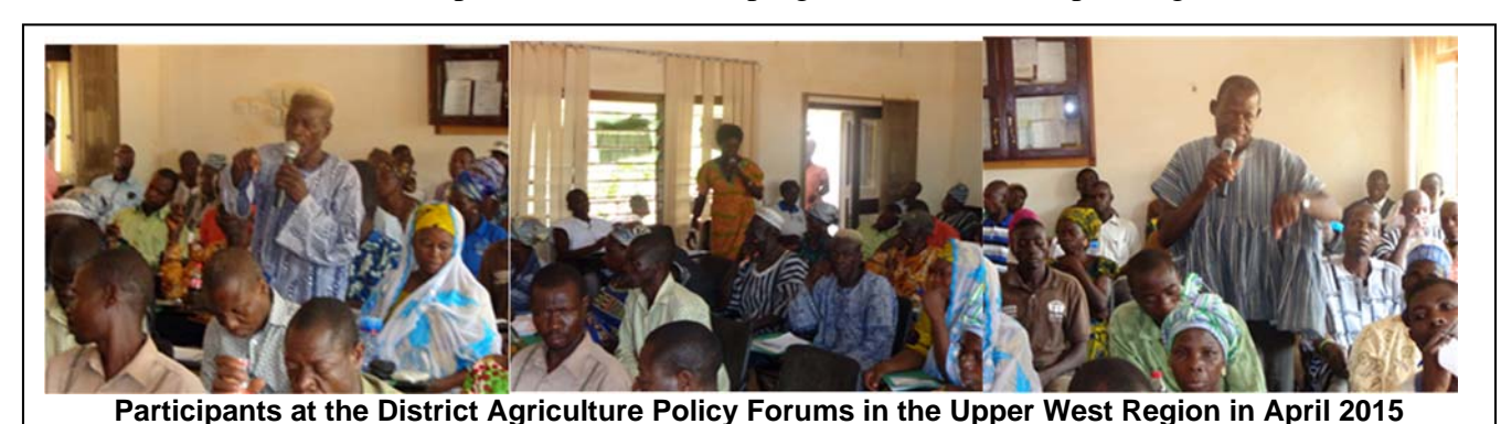
KRA 3.2: Improve the Capacity of the Private Sector to Advocate for Pro-Business Agriculture Sector Reforms in Ghana.

Carry out Advocacy Capacity Assessment (ACA) for Selected Media Organizations. Completed in Q1.