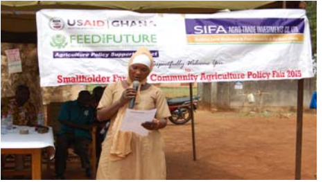
A Farmers' Representative presenting their concerns to the Government of Ghana during the Forum

Encouraging dialogues between smallholder farmers and public officials contributes to establishing an enabling environment for economic growth and social inclusion