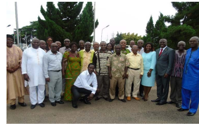
Participants who drafted Animal Health and Livestock Production Bills in

Study on Agriculture Insurance: In FY2 Q3, APSP tasked ISU to conduct a research study on the feasibility of agriculture insurance in Ghana. The draft report is completed and will be finalized during FY2 Q4.