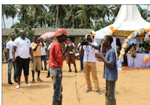
Drama by CCC members