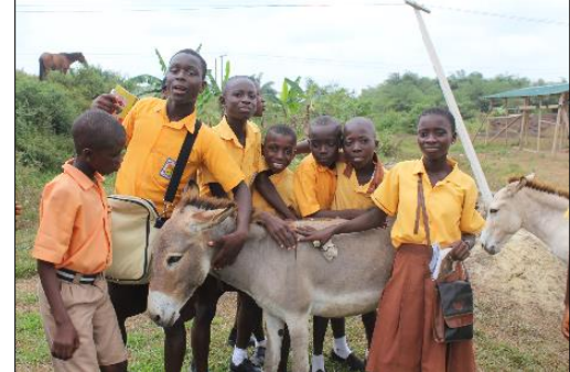
CCC members on an educational tour to agroforestry site

The USAID-funded and US Forest Service-managed CSLP has helped to form eight clubs to date, with membership of over 600 students. The clubs have been formed in the coastal districts of Ghana's Western Region and are engaged in several behavior change activities with one of the clubs having won a National Award in December 2015 for its work related to agriculture and the environment.