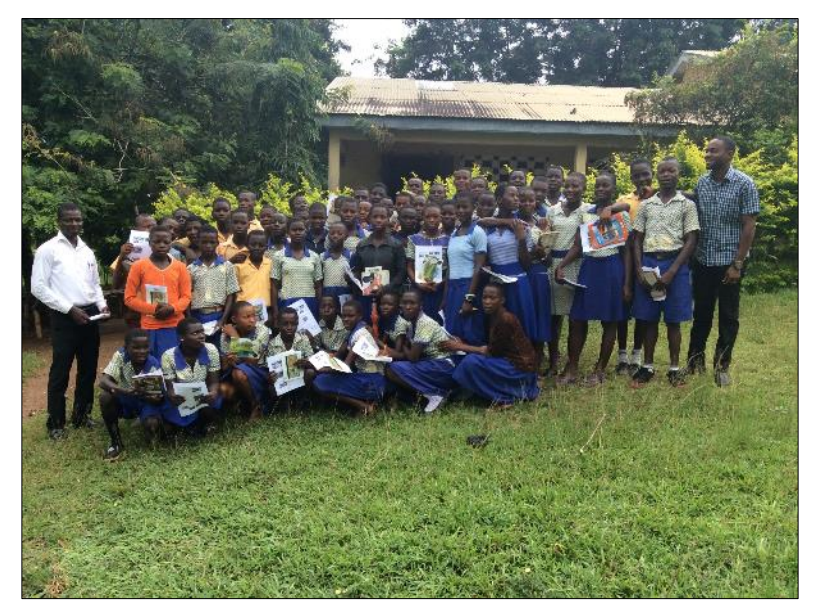
Photo 1. Members of the Akwidaa junior high school climate change club after a training

In a separate event, and as part of a collaborative effort with the USAID-funded Sustainable Fisheries Management Project (SFMP), the CSLP moderated a training of trainers (ToT) activity implemented by SNV focused on mangrove plantation establishment and management. This training took advantage of Shama District's experience in mangrove restoration and the CSLP's presence in these activities. There were participants from Yabiw, Akwidaa and also some Greater Amanzule communities supported by CSLP to learn as community trainers who can share the lessons learned within their respective communities.