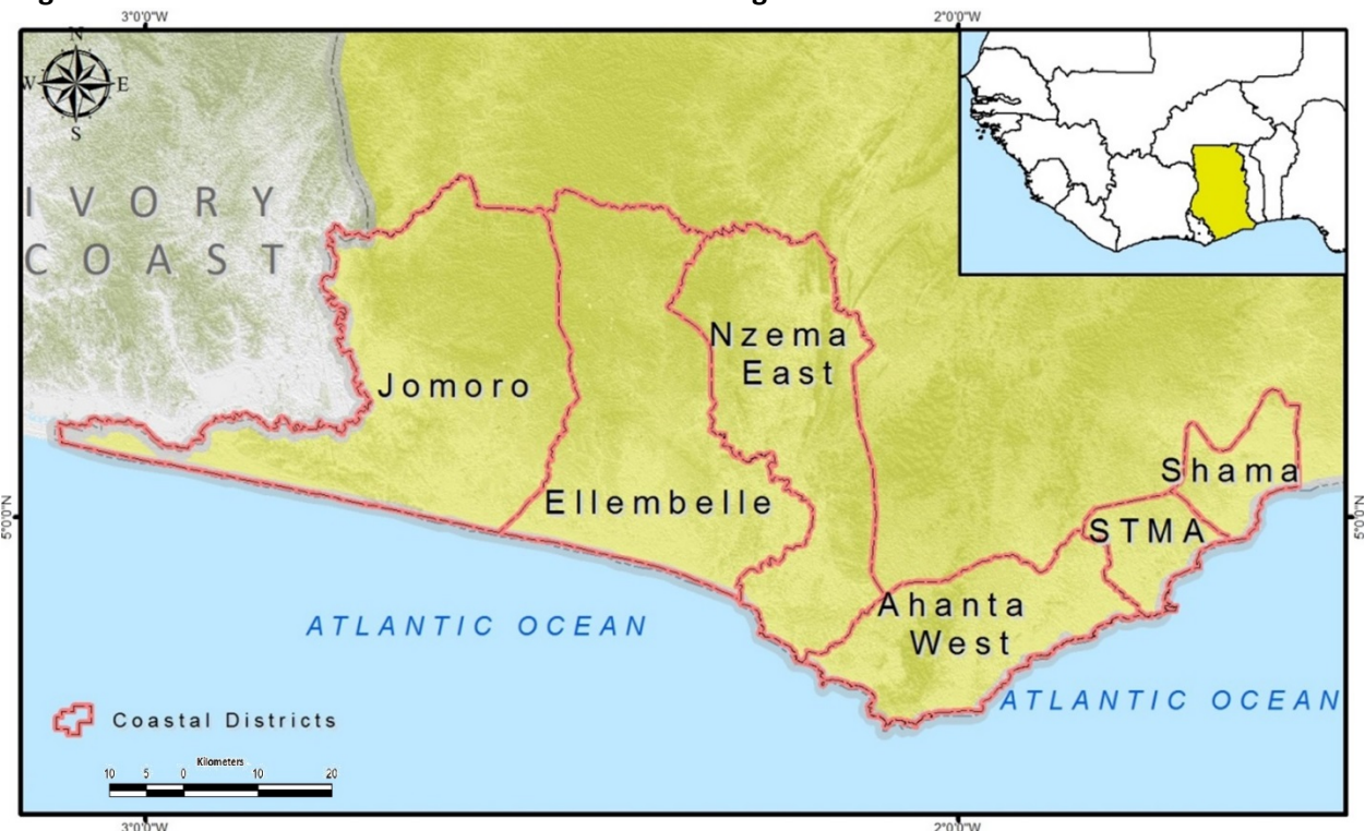
Figure 1. The six coastal districts in Ghana's Western Region

partners. The project's geographic area stretches from the Cote d'Ivoire border eastward through the Greater Amanzule wetlands complex, Cape Three Points, the Sekondi-Takoradi Metropolitan Area (STMA) and east to the Central Region border.