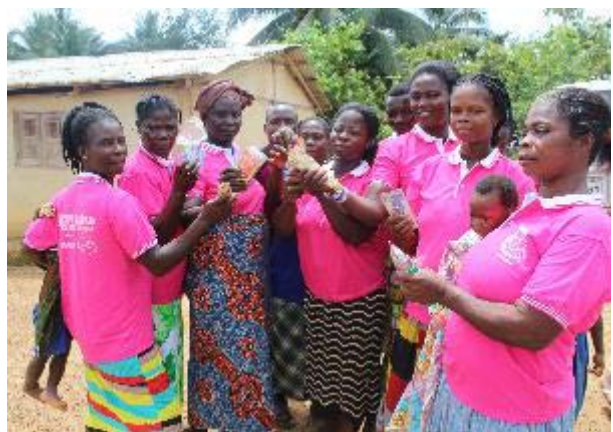
Excited VSLA members displaying their Profit after a share out

The 'Nyame Nhyira' group is among 19 VSLAs formed by the USAID-funded and US Forest Service-managed Coastal Sustainable Landscapes Project (CSLP). So far, six VSLAs have successfully completed their mandatory training cycle and shared out on the savings