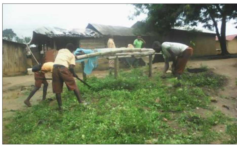
Climate change club members clearing weeds in a community during one of their clean up exercises

total of 1,910 students, comprising 932 boys and 978 girls in 36 public schools in Shama district of Ghana's Western Region have committed themselves to help tackle insanitary conditions that breed disease and cause injuries in their communities. This was a result of the Feed the Future Ghana funded Coastal Sustainable Landscapes Project's (CSLP) follow-on monitoring activities as part of a training of trainers organized in collaboration with the Ghana Education Service for 74 teachers.