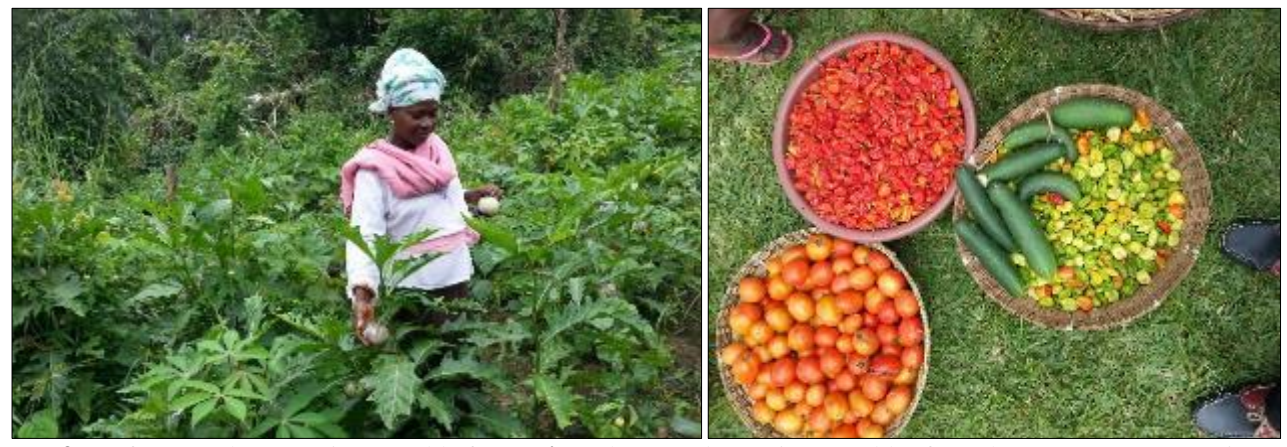
Left: A farmer at her organic vegetable farm. Right: harvested organic vegetables from the Fawoman community.

Zenabu Ibrahim, a local restaurant operator in Kamgbunli, a coastal community in Ellembelle District of Ghana's Western region noted, "I prefer buying eggplant from CSLP enlisted farmer because I can store the eggplant for more than one month and is still look fresh and in good state. I learnt no agrochemical is added during the production period. In fact, soup prepared from the eggplant is tasty."