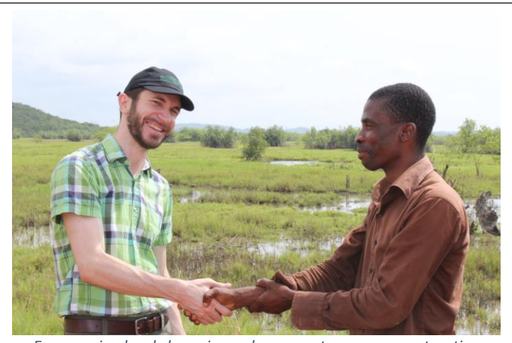
Encouraging local champions who support mangrove restoration