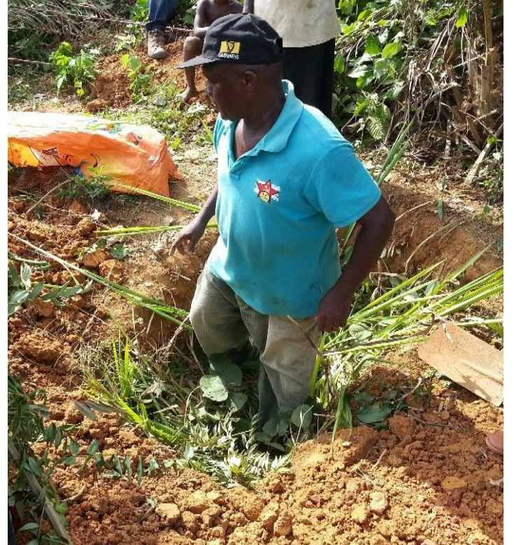
MoFA staff demonstrating how composting materials are piled in the pit at Cape Three Point (Ahanta West District)