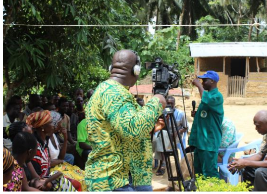
Media Day at Ayawora

Objective of the trip: Aimed at providing the media personnel and GoG officials the opportunity to experience CSLP activities in the communities, interact with the farmers and visit farms / project sites.