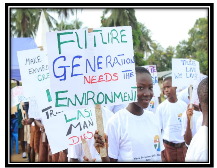
Club members marching through a community with messages on Climate Change to raise awareness

The District Director of Education for Jomoro District of Ghana has observed, "... the CSLP has caught these children at the right time, for as you catch them young, they will be yours forever".