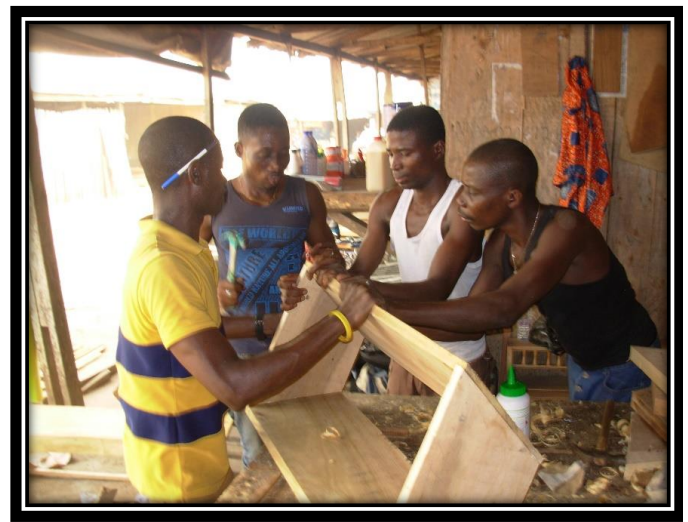
Beehive construction training

Initial reports are that farmers have already contacted one carpenter to engage his services on such construction. CSLP intends to engage these newlytrained carpenters on further beehive construction needs as well.