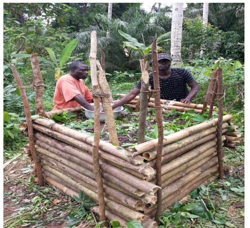
Hands on training session with farmers: Completed stock composting pile at Adusuazo in the Jomoro District.