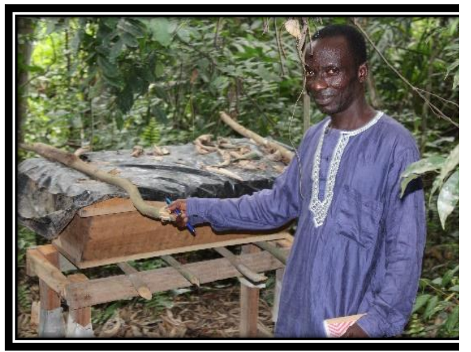
Farmer standing by his colonized beehive in a secondary forest