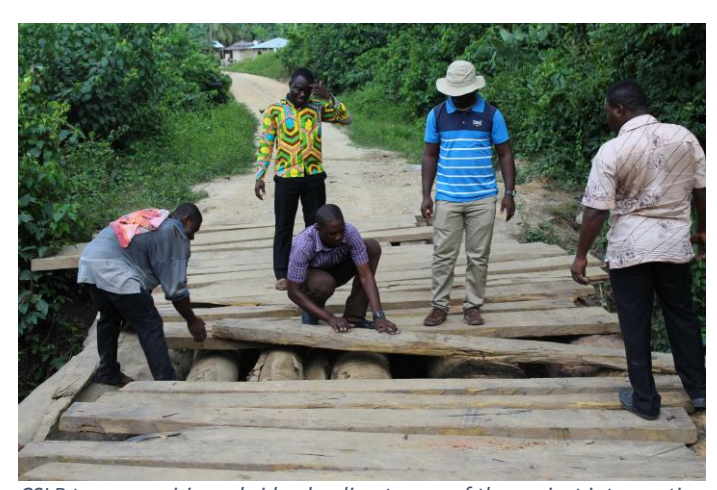
CSLP team repairing a bridge leading to one of the project intervention communities