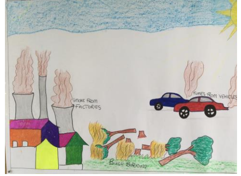
Climate Change Ambassadors Created Page 7