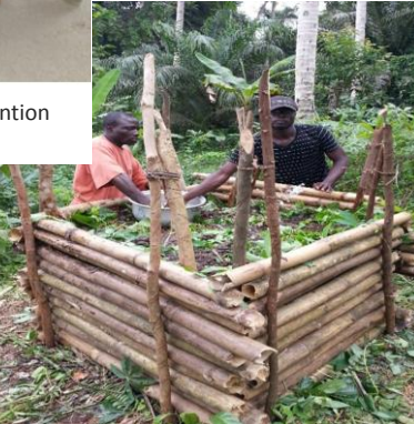
Farmers adopt Climate Smart Agriculture practices Page 4