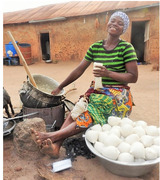
Sawda processing food for sale, Nasamba, Nanumba South