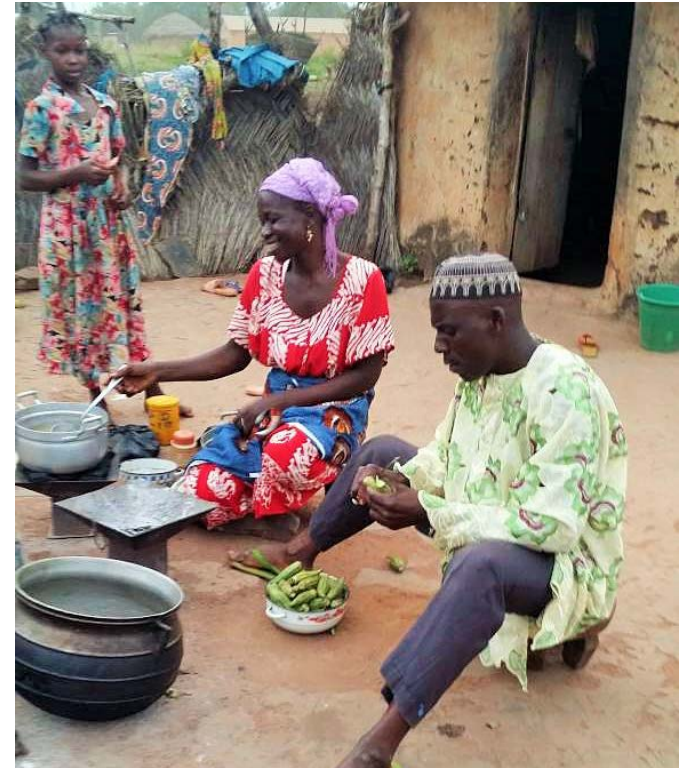
Husband and wife team cooking for the family, Nasamba, Nanumba, South District.