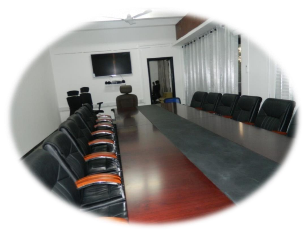
Departmental/ CCM library